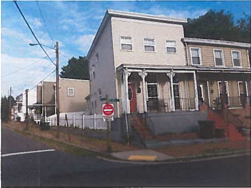
Front and Side views of my house With the new fence