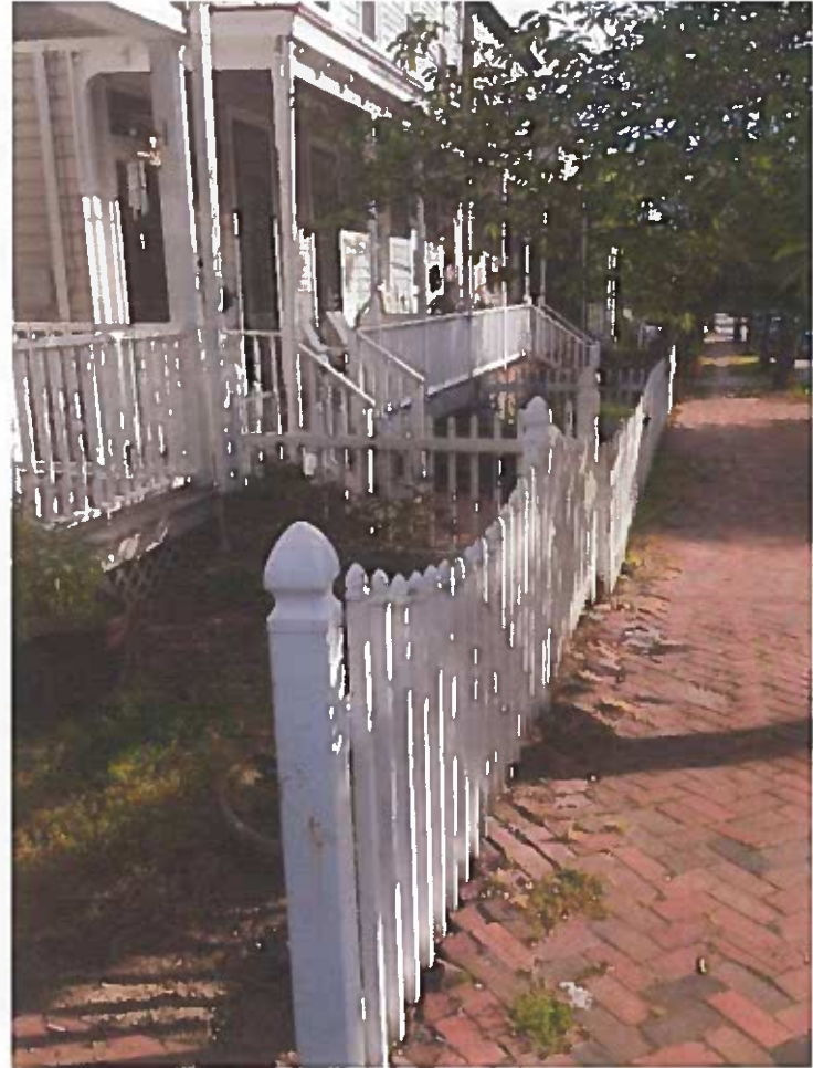
Half the block is vinyl