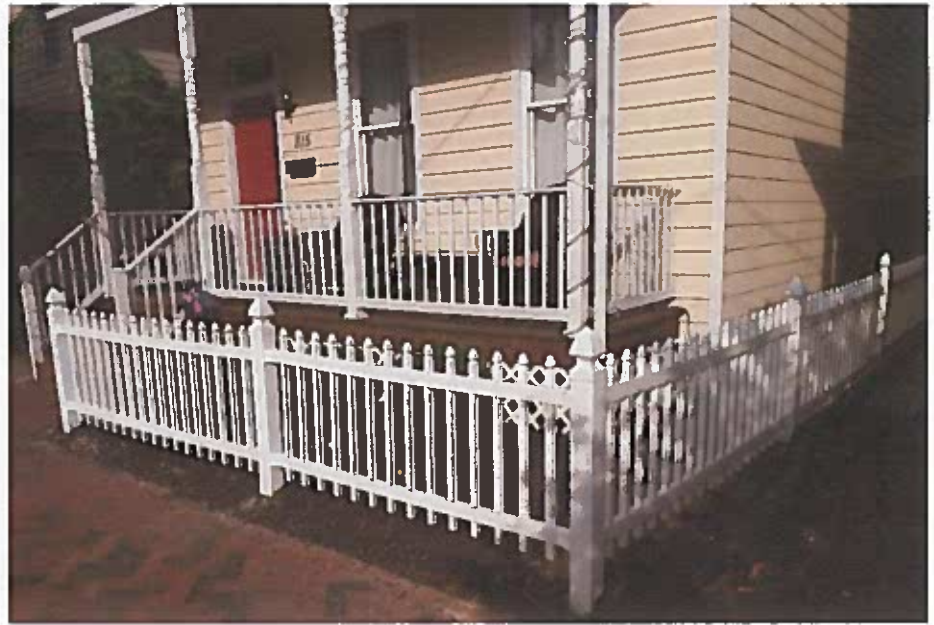
Vinyl front and side yards