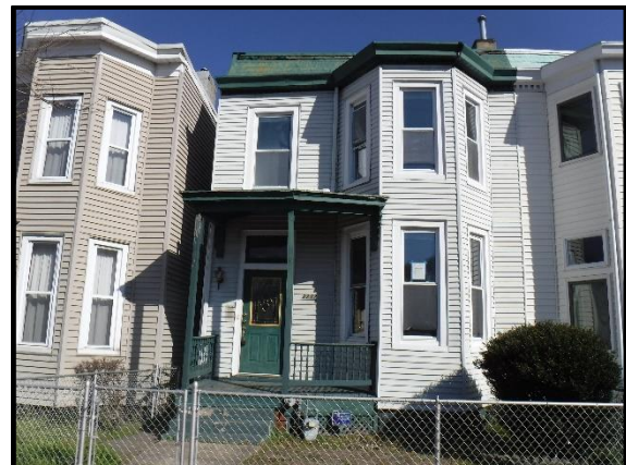
2212 Jefferson Ave (March 2018)

Proposal: The applicant proposes to construct a two-story addition at the rear of the property in the location of the original side porch. The proposed addition will be 14' by 8' and will be clad in smooth, unbeaded fiber cement siding. The proposed roof and walls will align with the existing roof and building walls. The applicant proposes to differentiate the new addition with vertical trim pieces. The applicant proposes to install a 1/1 wood window and a half lite door on the first-floor rear of the structure.