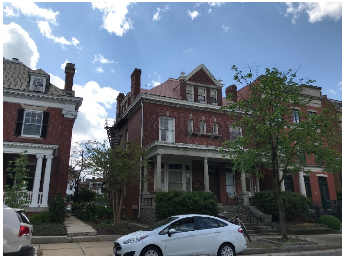
Figure 1. Facade and east side of 1831 Monument Avenue