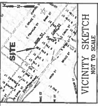
VICINITY SKETCH NOT TO SCALE