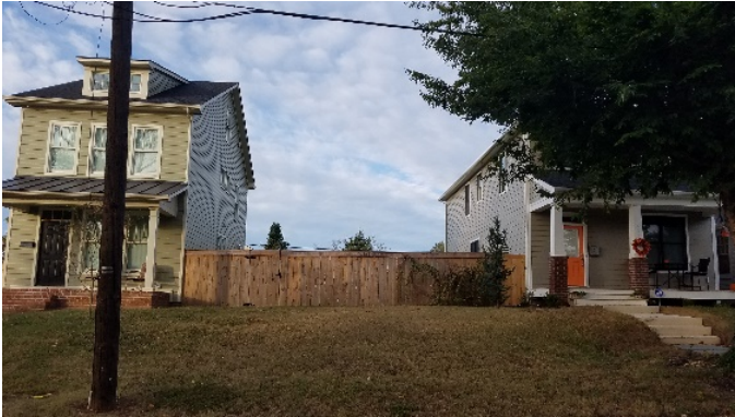
Figure 1. 510 W. 19th Street.