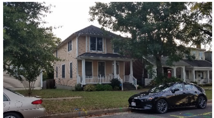
Figure 6. 509 W 19th Street.