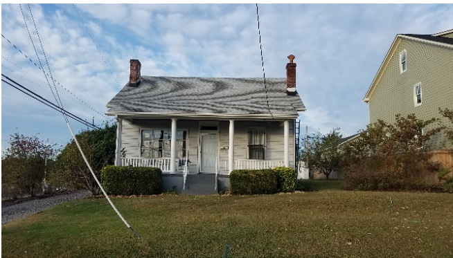
Figure 3. 502 W. 19th Street.