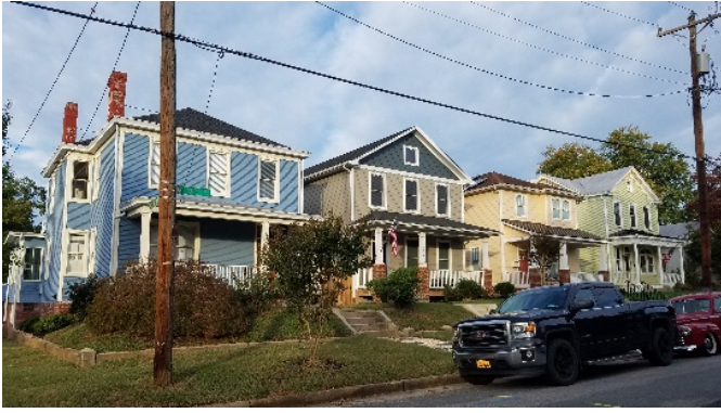
Figure 7. 600-606 W. 19th Street.