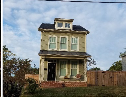
Figure 2. 506 W. 19th Street.