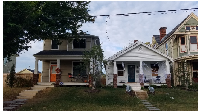
Figure 4. 512 and 514 W. 19th Street.