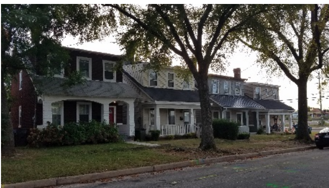
Figure 5. 501-507 W. 19th Street.