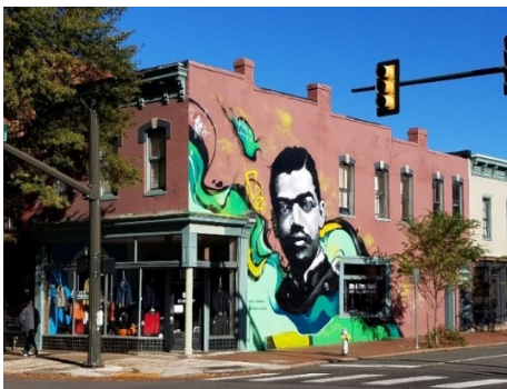
Figure 1. View of Mural looking northwest.