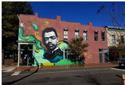
Figure 2. View of Mural looking west.