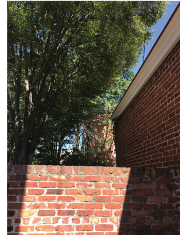
VIEW OF REAR ELEVATION FROM ALLEY