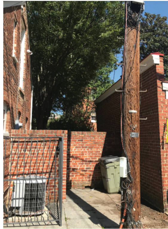
VIEW OF REAR ELEVATION FROM ALLEY