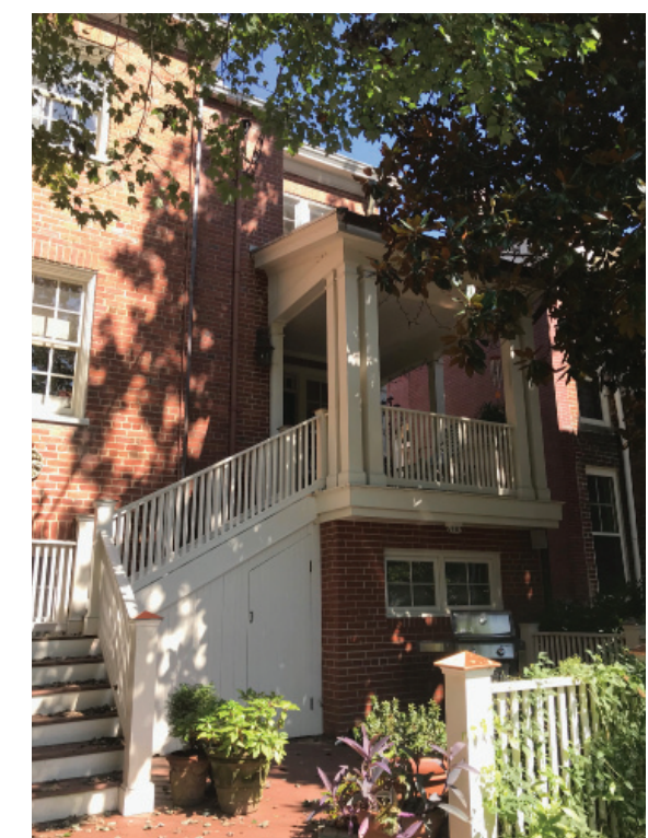
EXISTING REAR STAIR TO REMAIN