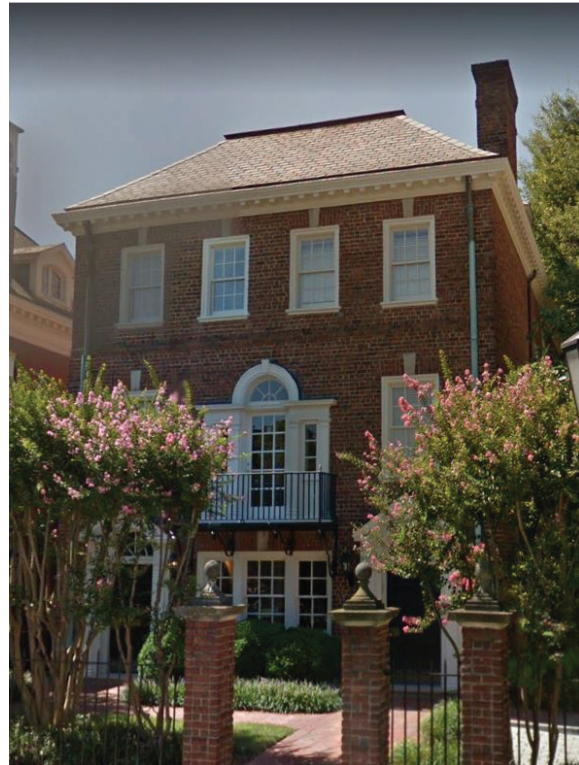
FRONT ELEVATION (NO WORK)