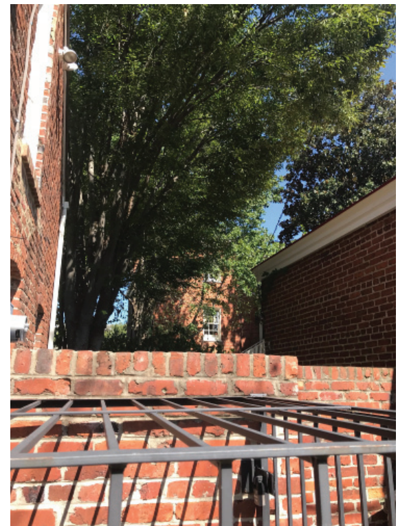
VIEW OF REAR ELEVATION FROM ALLEY