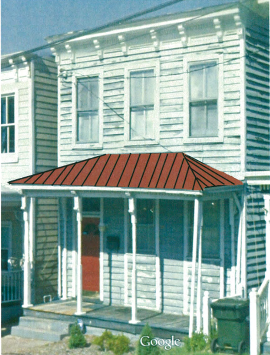
Rough model of future porch