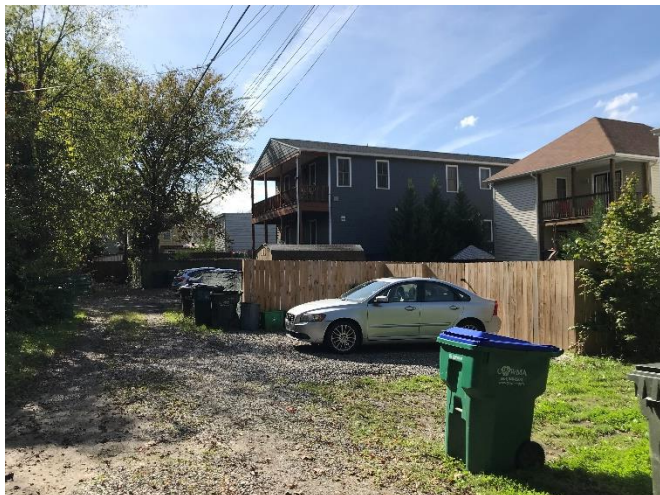
Figure 1. Rear yard as viewed from alley.