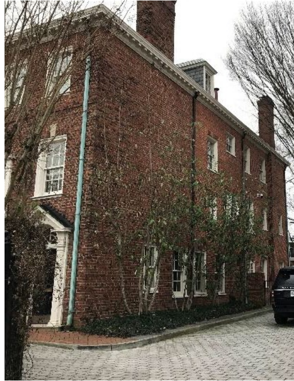
Figure 2. West elevation.