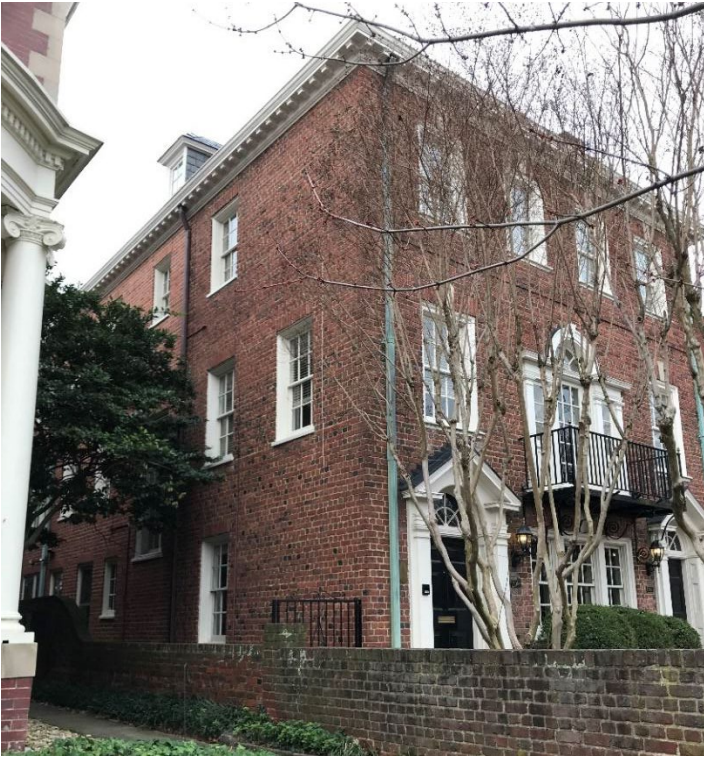
Figure 1. Façade and east elevation.