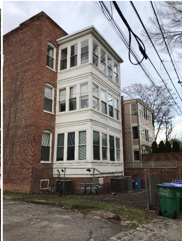
Figure 4. 2011 Monument Ave, enclosed rear porch.