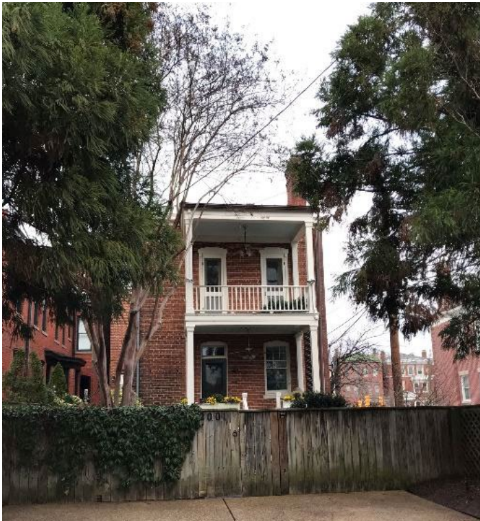
Figure 3. 2001 Monument Ave, rear porch.