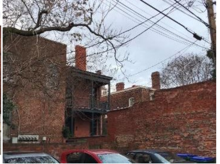
Figure 6. 2003 Monument Avenue, rear porch.