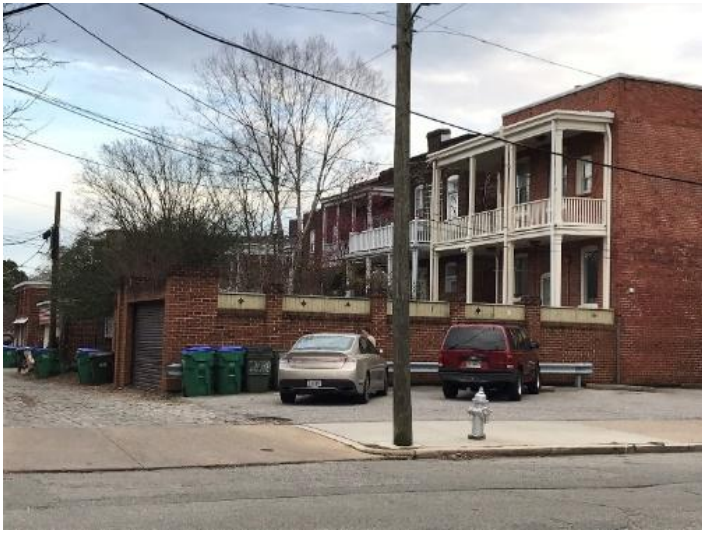
Figure 5. 2000 Block Monument Avenue, even side, rear elevations.