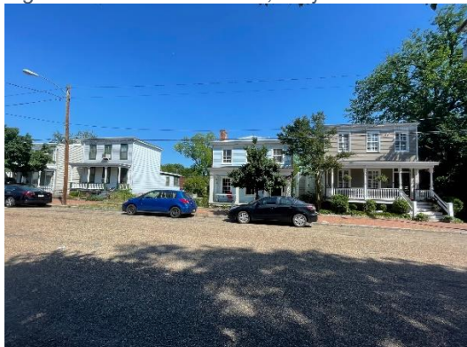
Figure 3. West side of N. 28th Street.