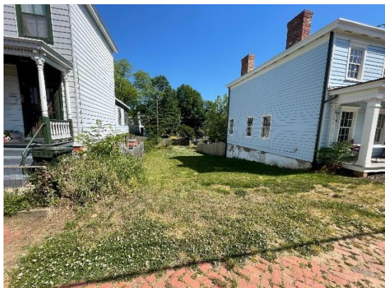
Figure 1. 309 N. 28th Street, subject vacant lot