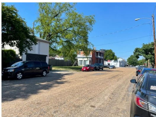
Figure 5. East side N. 28th Street.