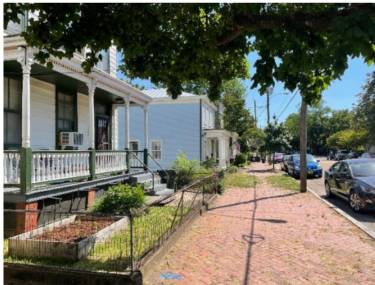
Figure 4. N. 28th Street