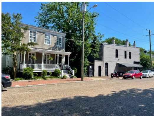
Figure 2. East side of N. 28th Street.