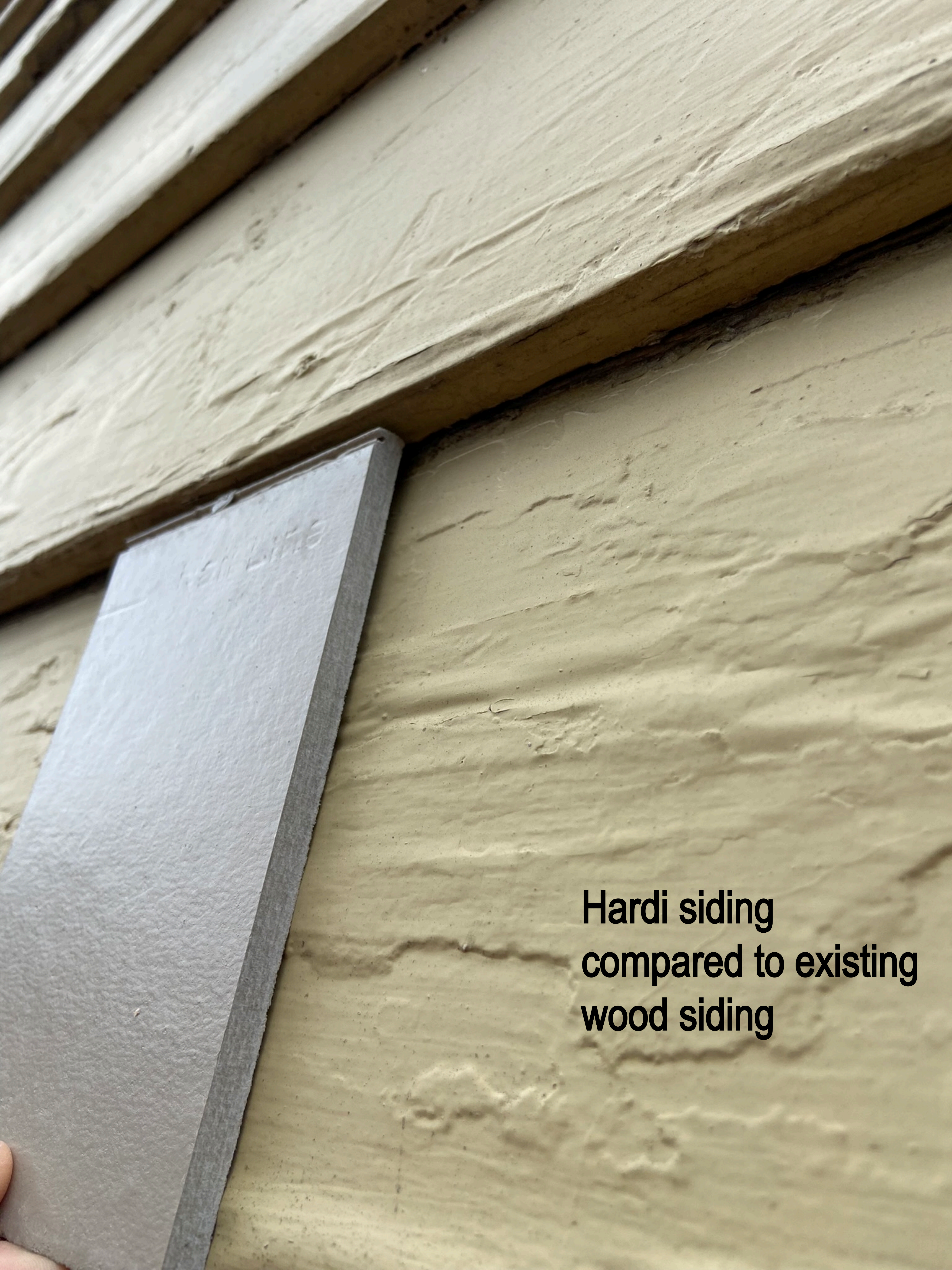
Hardi siding compared to existing wood siding