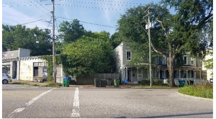
Figure 2. 2211 and 2203-2205, 2207, and 2211 Jefferson Street.