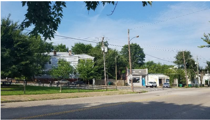
Figure 3. 2211 and 2225 Jefferson Street and side elevation of 420 North 23rd Street.