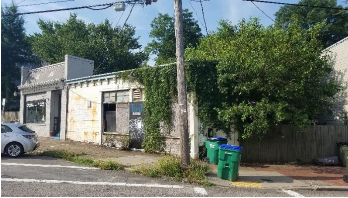
Figure 1. 2211 Jefferson Street.