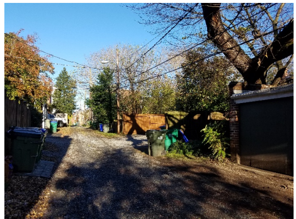
Figure 6. View towards project location from 28 th Street.