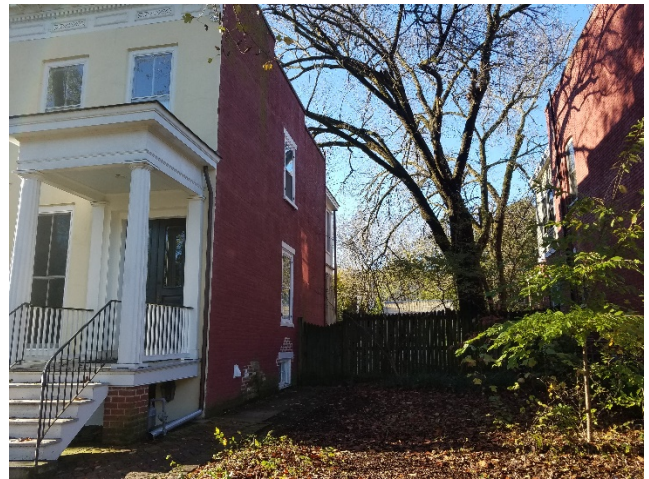
Figure 4. View towards project location from East Broad Street.