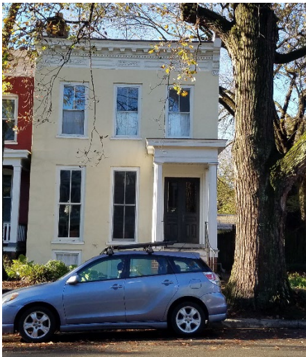
Figure 3. 2711 East Broad Street.