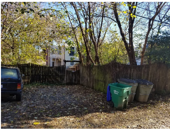
Figure 5. View of project location from rear alley.