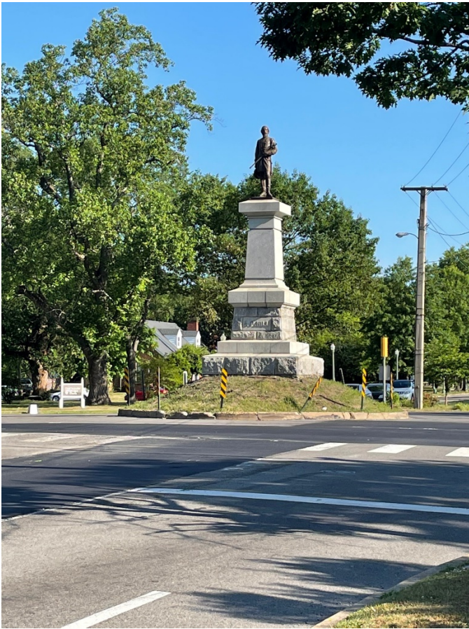
Figure 1. A.P. Hill Monument, current conditions.