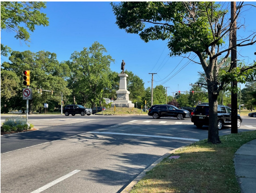
Figure 2. A.P. Hill Monument, current conditions.