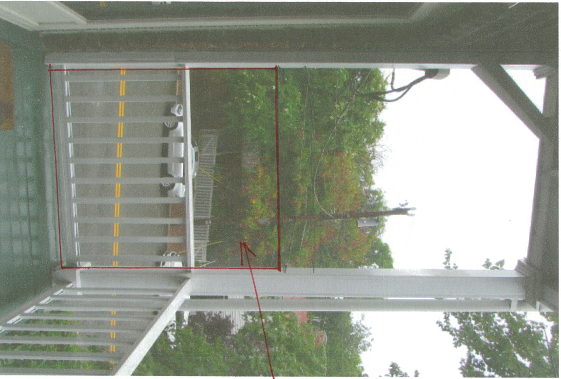
White Framed Square Lattice