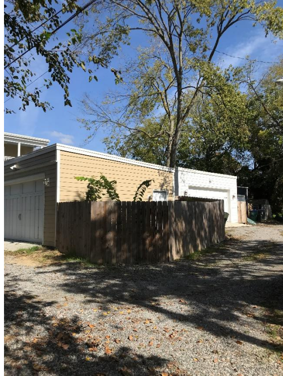
Figure 4. New construction outbuildings on the subject block.