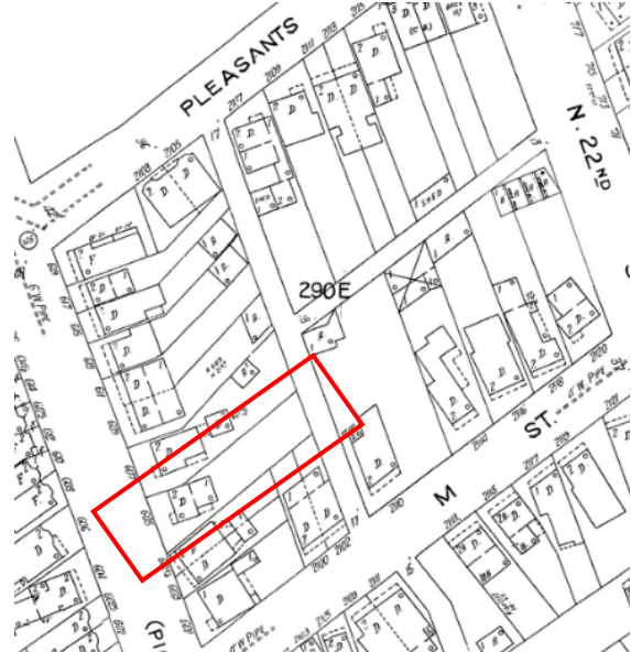
Figure 2. Subject block, Sanborn Map 1950