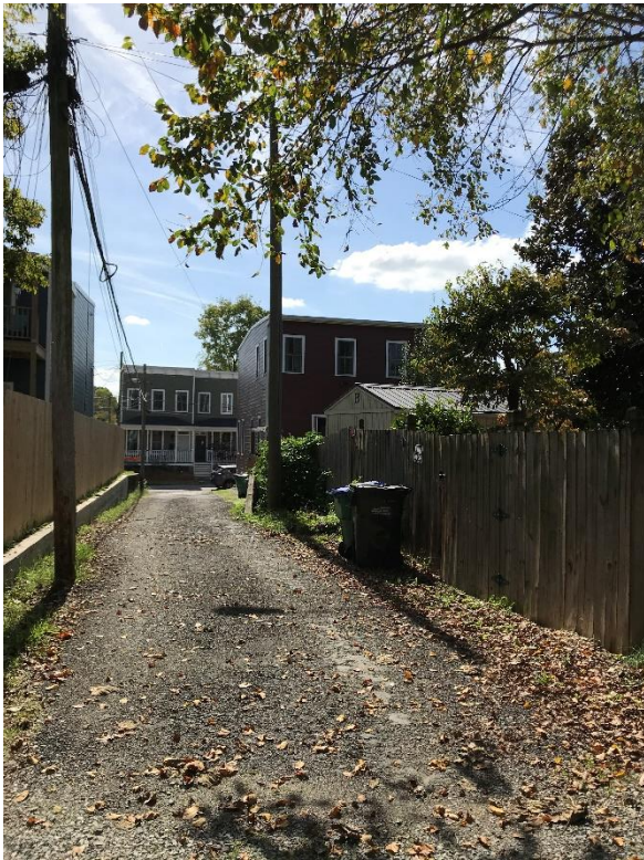
Figure 3. View of rear of property from alley.