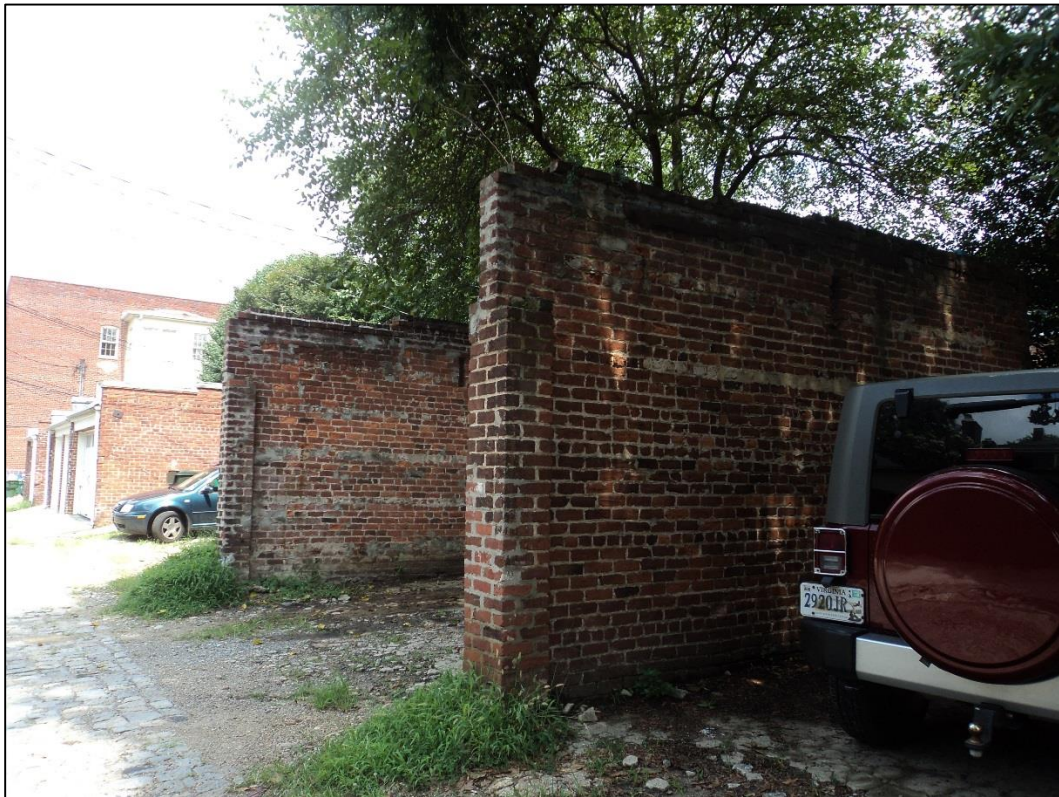
2729 West Grace Street Surrounding Garages.