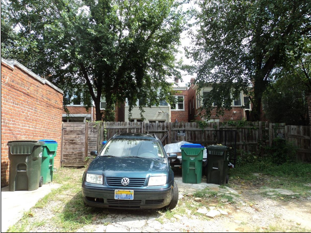
2729 West Grace Street Location of Proposed Garage.