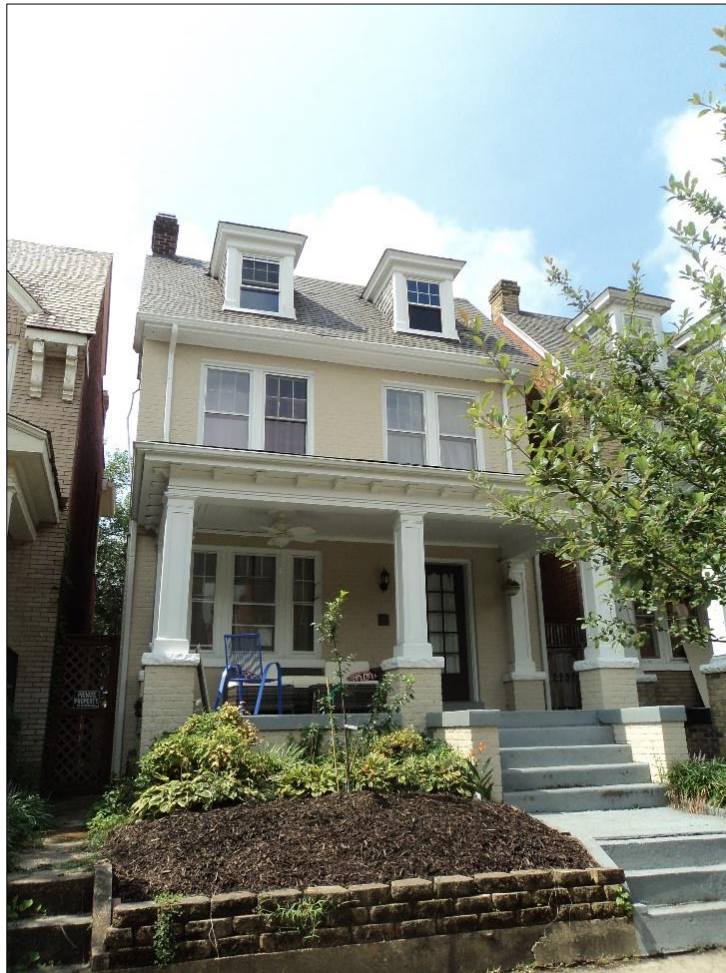
2729 West Grace Street.

The applicant requests approval to construct a two-story garage at the rear of a single family home in the West Grace Street City Old and Historic District. The existing building on the property is a two-and-one-half story, two-bay, masonry building with a side-gable roof, and a one-story, full-width porch.