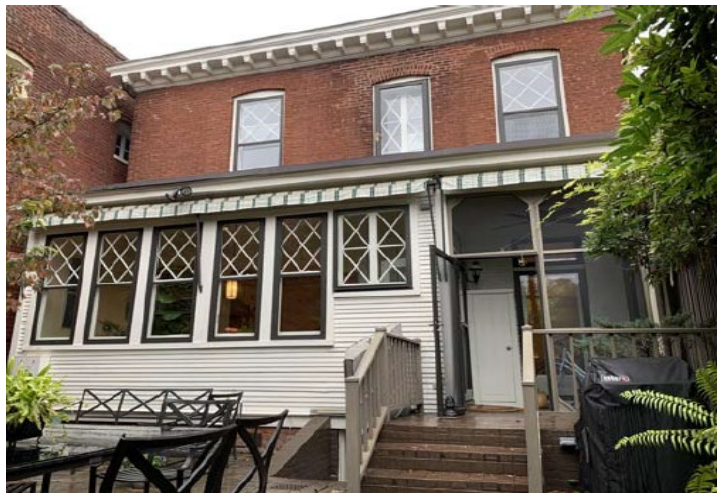
Figure 4. Rear of property. As seen from inside the property boundary. Existing wood railing and 1-story, frame mass.