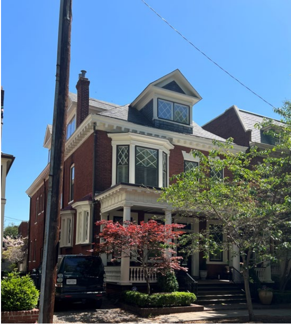
Figure 1. 405 N. Allen front facade.