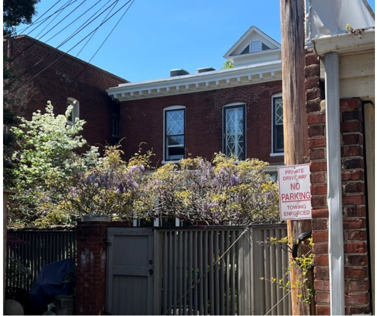
Figure 2. 405 N. Allen, view of rear facade from alley.