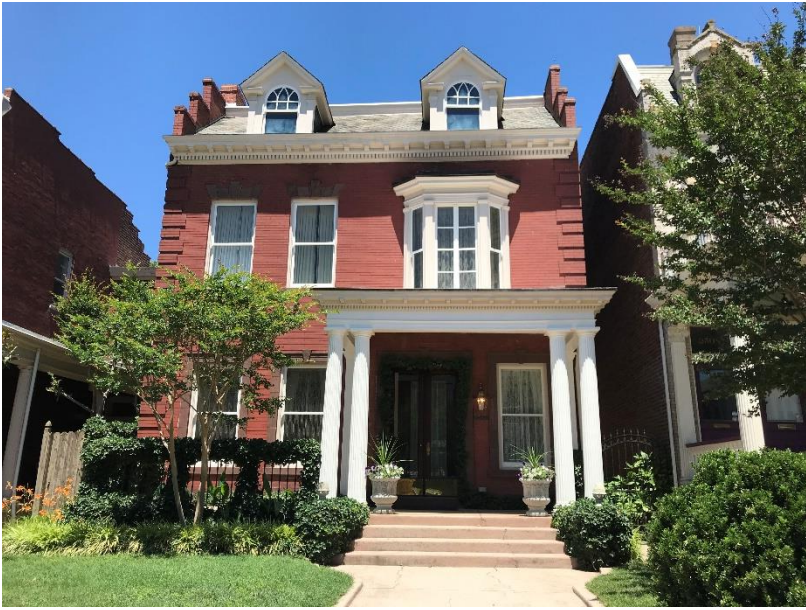
Figure 1. Façade