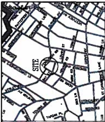
VICINITY MAP 1" = 1000'