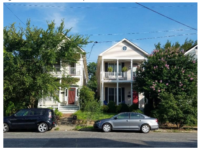
Figure 4. 610 and 612 North 29th Street.