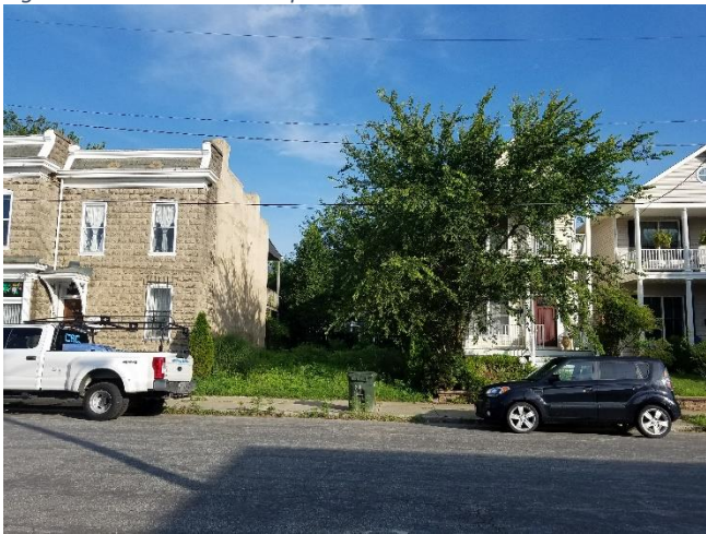
Figure 3. 606-608 North 29th Street.