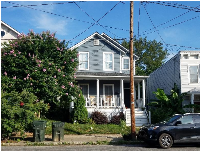
Figure 5. 616 North 29th Street.