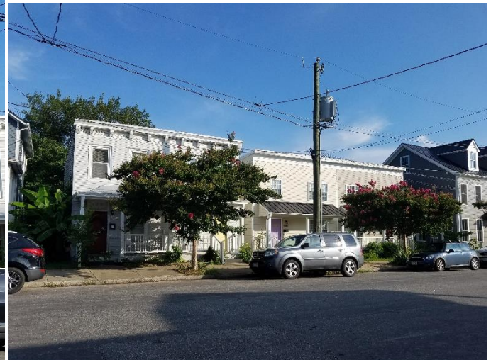
Figure 6. 620-622 North 29th Street.