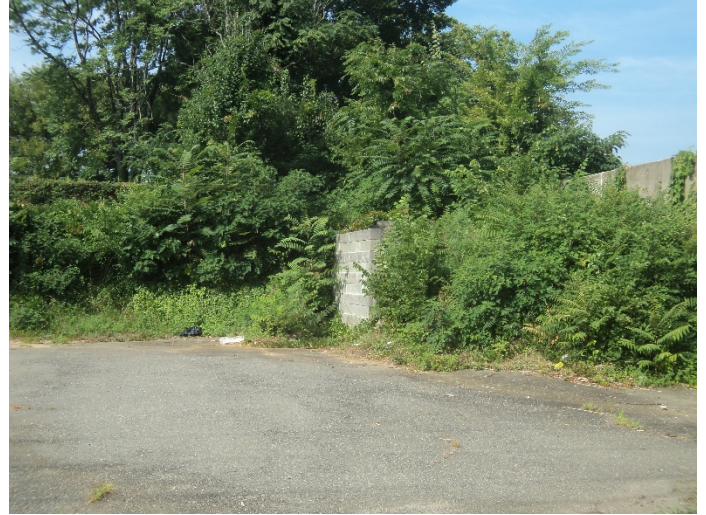
Figure 2. CMU dumpster enclosure