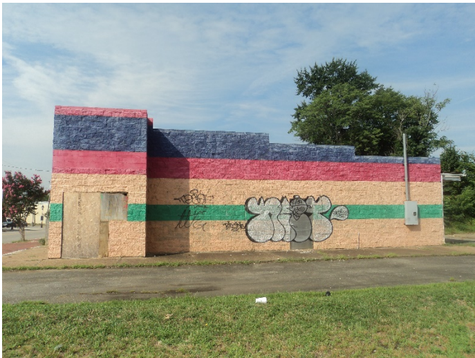
Figure 3. North elevation