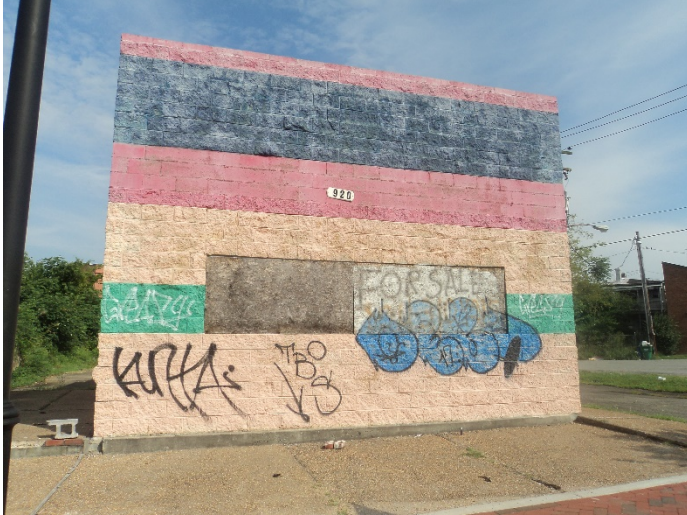
Figure 1. Façade