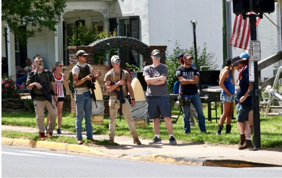
June 7, 2020. Gun rights extremists gather with long guns outside a gun store to watch the Black Lives Matter march in Purcellville.