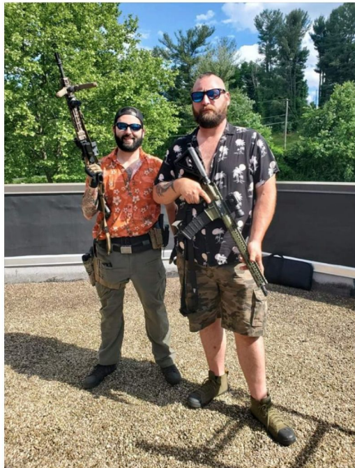
This picture of two snipers in Boogaloo shirts with long guns is part of the advertising campaign by Triune Shooting Sports in Warrenton, VA. Their roof

Also our other 2 eyes on the roof! Thank ya'll for your help!