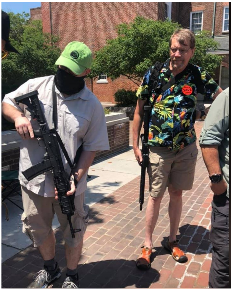
Gun rights extremists (One in a Boogaloo shirt) assemble in Market Square, Alexandria VA on June 13, 2020.

I am sure I do not need to remind the Richmond City Council of the assault of these extremist gun rights groups on local governments as they pushed their Lawless City Resolutions this winter or the thwarted terrorist plot planned for Richmond during their hijacking of what should have been a memorial to Martin Luther King, Jr. on January 20. And now, as Richmond and other cities around Virginia plan marches and demonstrations for Black Lives Matter, these armed terrorists continue to show up with their weapons of war intending to threaten and intimidate and to promote their racist, “guns everywhere” agenda. The following photos have been collected from MOMS all over VA and the captions below will help explain the context. In each example, you will see how these armed gun rights terrorists showed up to threaten and intimidate people at Black Lives Matter marches and rallies.