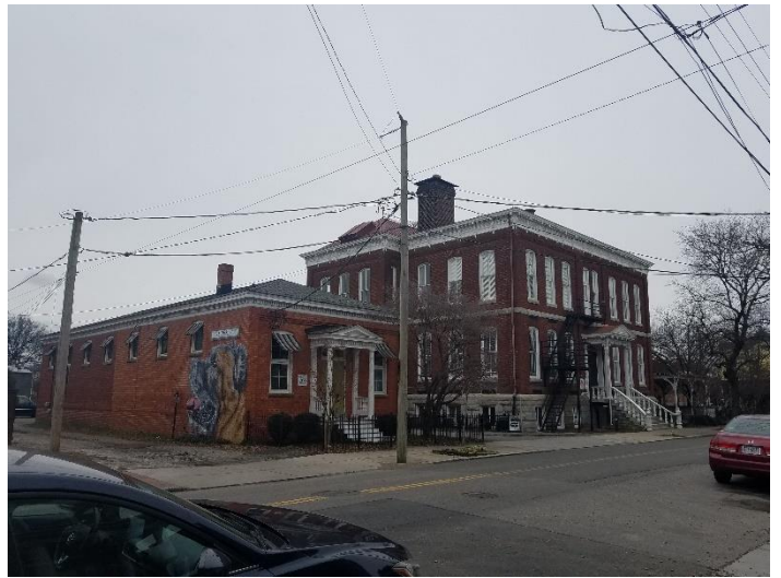
Figure 2. View of building from South Lombardy Street