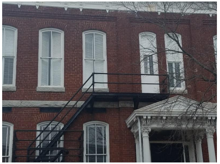
Figure 4. Modified opening to the fire escape, west elevation