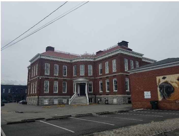
Figure 3. View of rear elevations from the alley