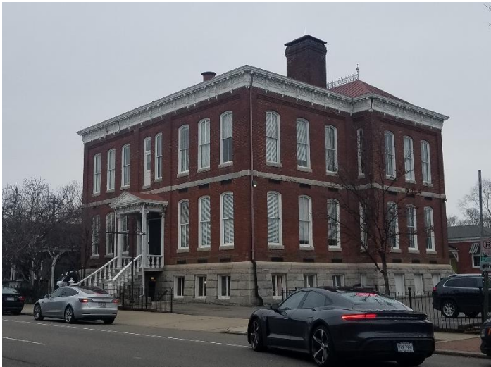
Figure 1. View of building from West Main Street