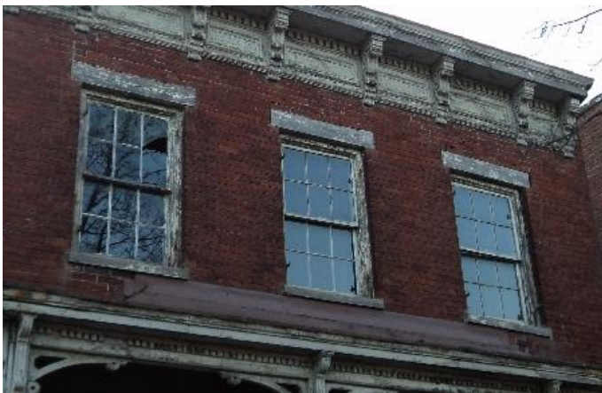
Figure 1. Front windows, November 2017, showing shutter hinges.