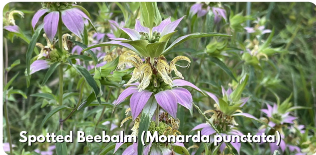
Spotted Beebalm ( Monarda punctata )