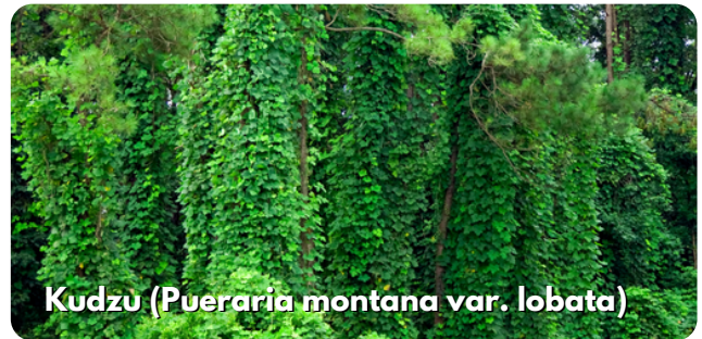
Kudzu ( Pueraria montana var. lobata )

Gardens that are designated as Virginia Friendly Landscapes will be exempt from the 12" lawn height restriction set forth in the municipal code in section 11-105(a). This designation may be revoked at any time if the property is not in compliance with the requirements as provided in section 11-105(f), the property has become a threat to health, safety or the environment, or if all required setbacks are not adequately maintained as provided in section 11-105(f)(iv).