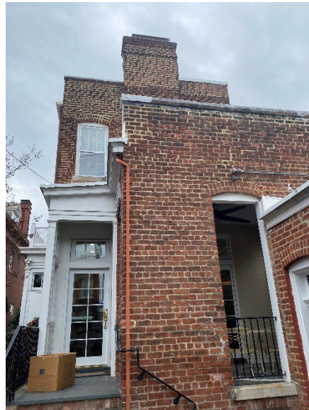
Figure 2. Existing Conditions