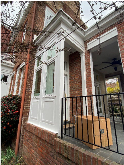
Figure 1. Existing Conditions