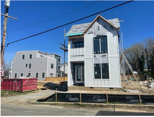
Figure 5. 967 Pink St.