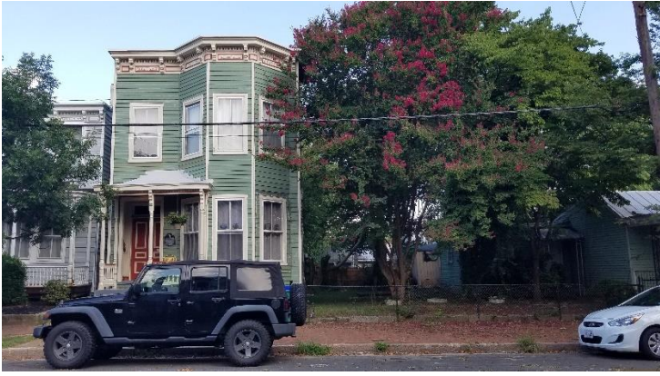
Figure 7. 418 and 416 North 26th Street.