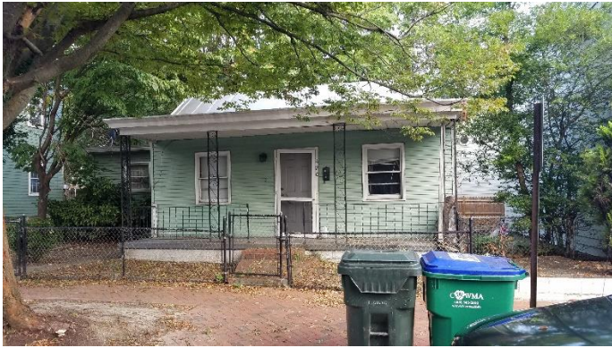
Figure 1. 420 North 26th Street, façade.