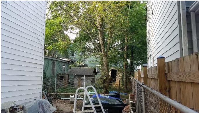
Figure 3. 420 North 26th Street, rear elevation. View from East Clay Street.