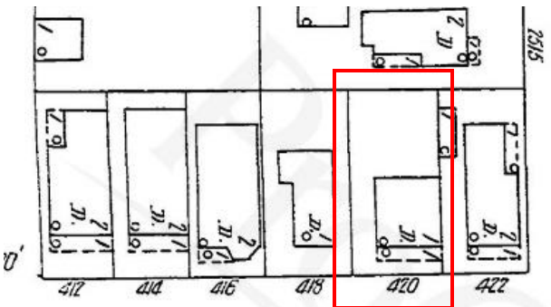
Figure 5. 1905 Sanborn map