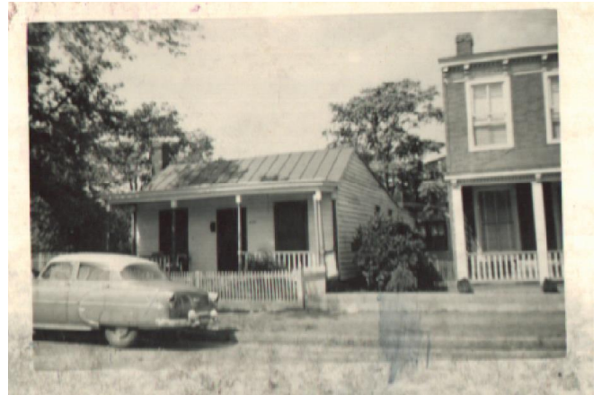
Figure 4. 420 North 26th Street, ca. 1960.