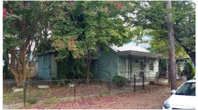
Figure 2. 420 North 26th Street, side addition.