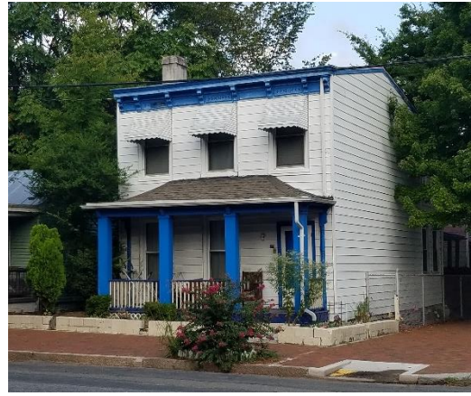
Figure 8. 422 North 26th Street.