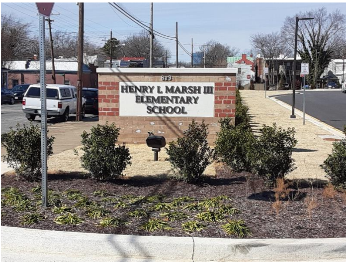
Figure 3. 813 N. 28th Street, existing sign detail.