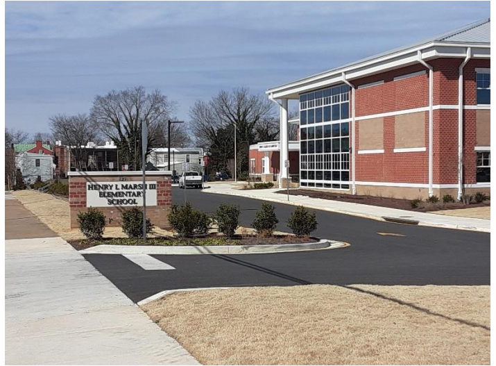
Figure 2. 813 N. 28th Street, existing sign.