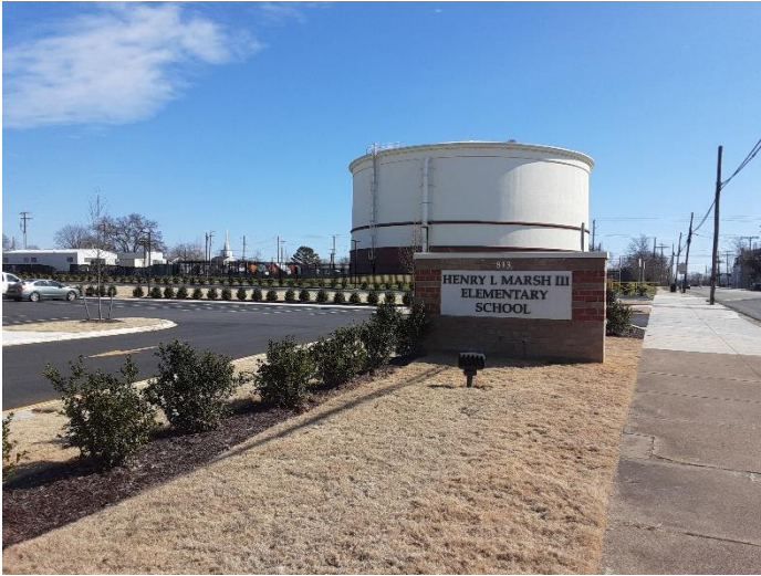
Figure 1. 813 N. 28th Street, existing sign.