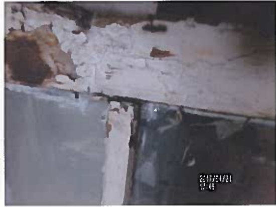
Window # 5