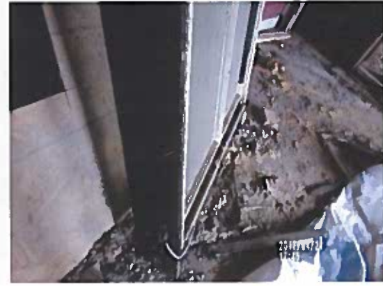
Window # 5