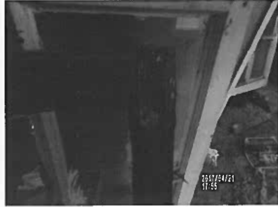
Window # 7