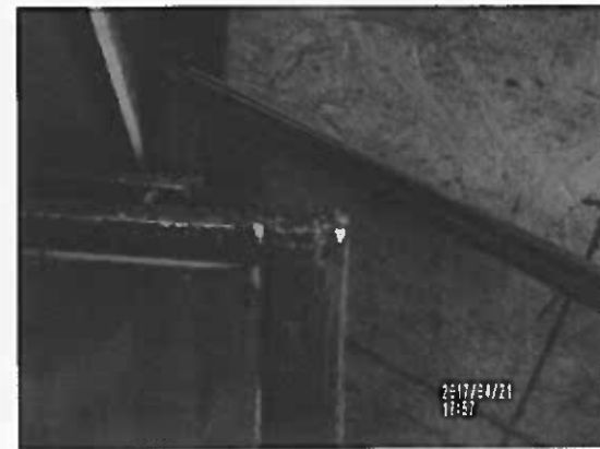
Window # 8