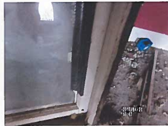
Window # 5