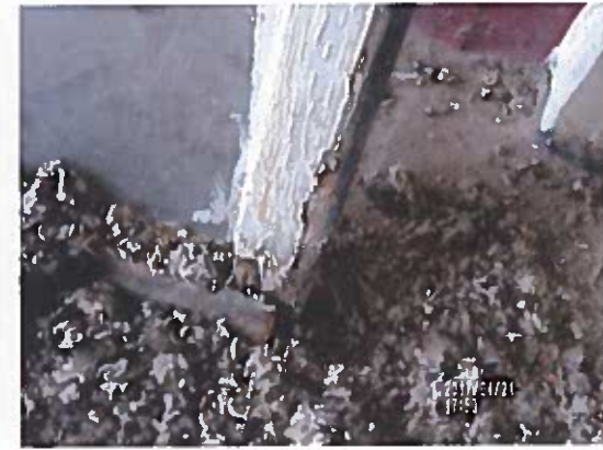
Window # 6