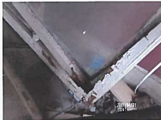
Window # 4