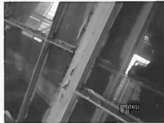
Window # 8