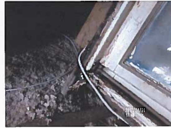
Window # 5