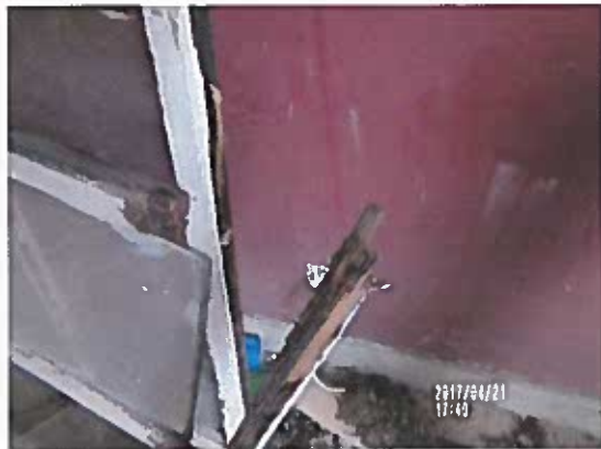
Window # 4