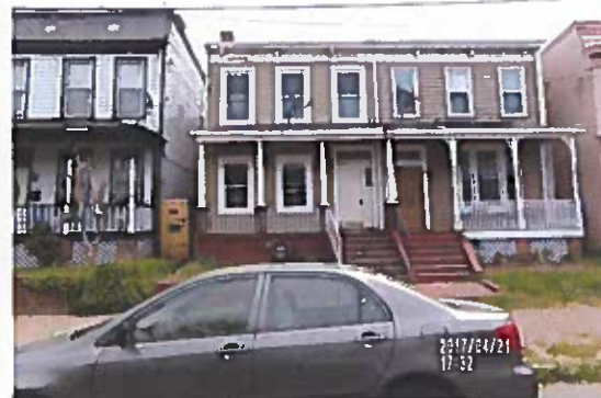
Front view 4/23/18 with neighborina homes