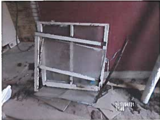
Window # 4