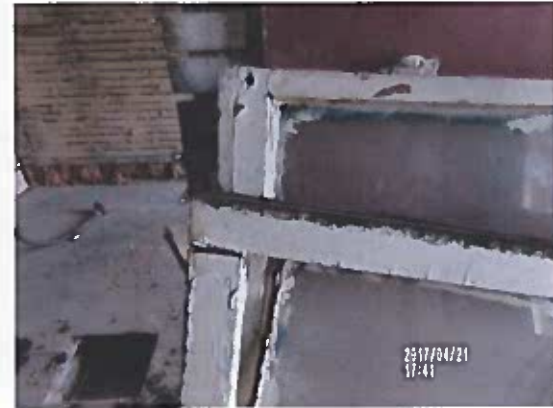
Window # 4