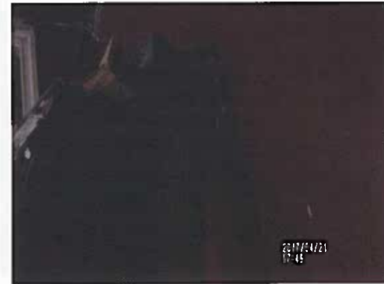
Window # 5