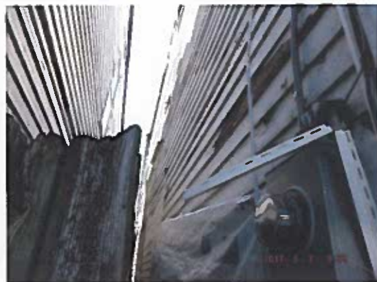
Side view 5/6/17