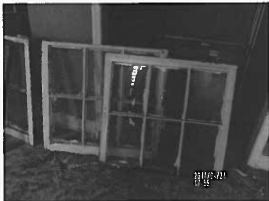
Window # 8