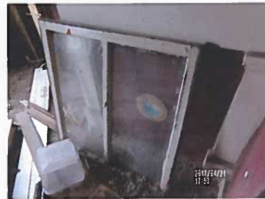
Window # 6