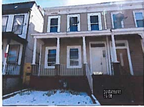
Front View 3/13/18