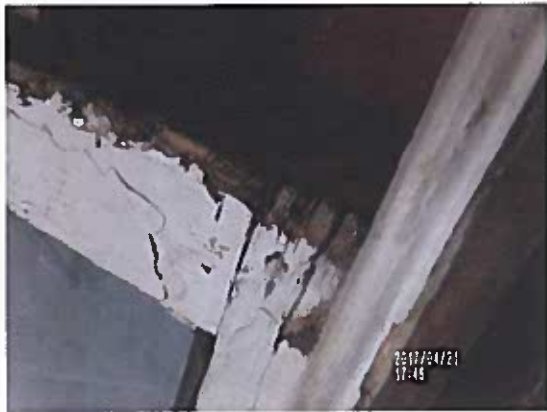
Window # 5