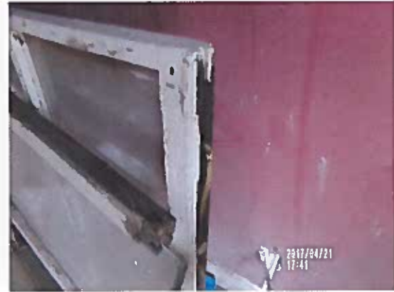
Window # 4