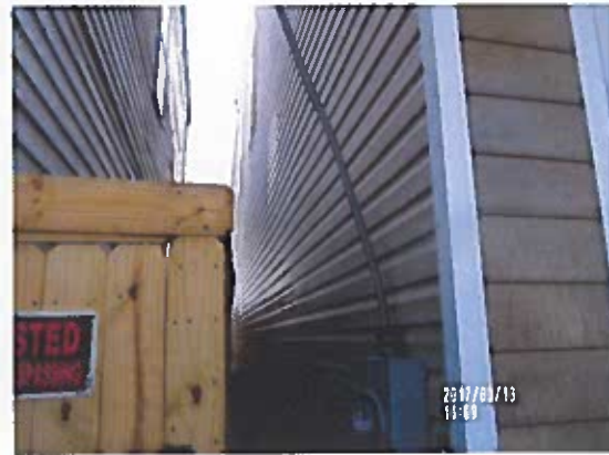
Side view 3/13/18