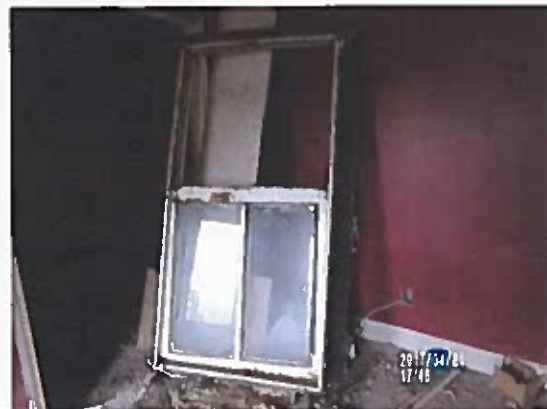
Window # 5