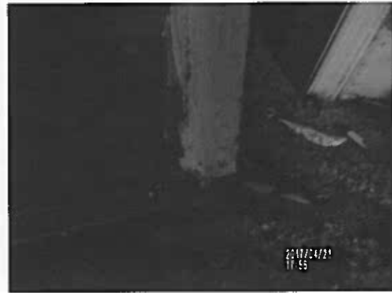
Window # 8