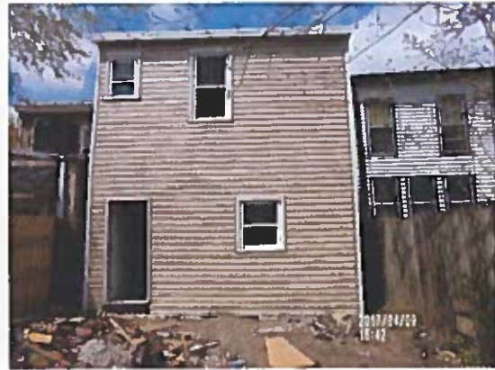
Rear view 4/11/18