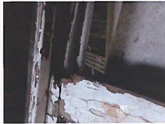
Window # 5