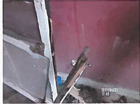
Window # 4