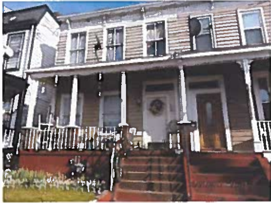
Front View 3/21/17