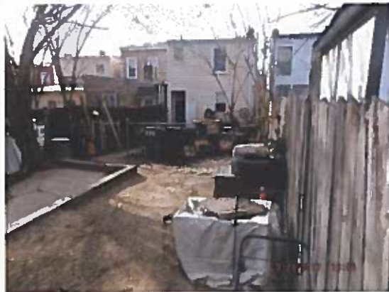
Rear view 3/21/17