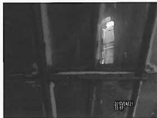
Window # 8