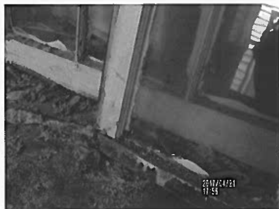
Window # 8