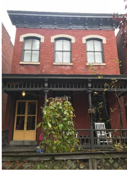
Figure 2. Facade of main structure at 407 West Marshall