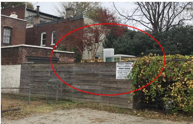
Figure 3. Construction of Greenhouse 407 West Marshall (Looking NE)