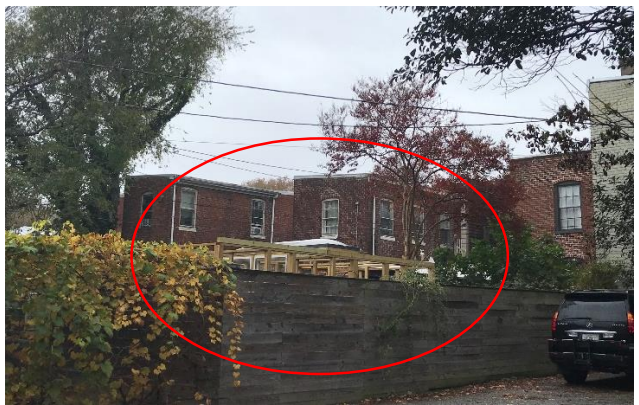
Figure 4. Construction of Greenhouse at 407 West Marshall (Looking NW)