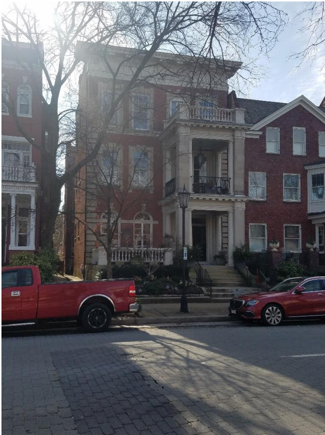
Figure 1. 2007 Monument Avenue.