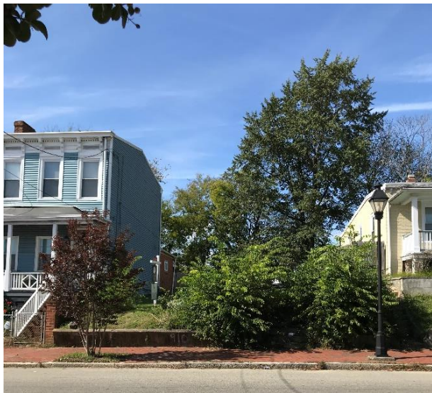
Figure 3. 910-912 North 25th Street