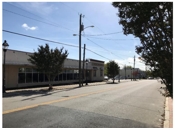
Figure 6. 900 block North 25th Street, odd side