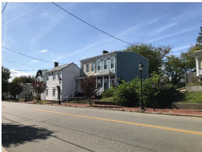
Figure 5. 900 block North 25th Street, even side south of subject lot