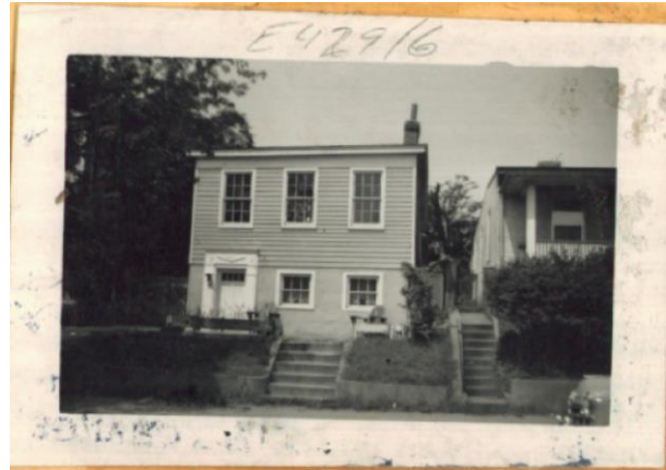
Figure 2. 910 North 25th Street, ca. 1957-77