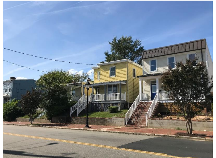
Figure 4. 900 block North 25th Street, even side, north of the subject lot