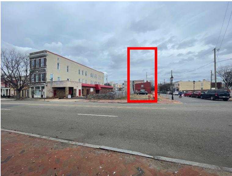
Figure 3. General location of new construction on lot and surrounding context.