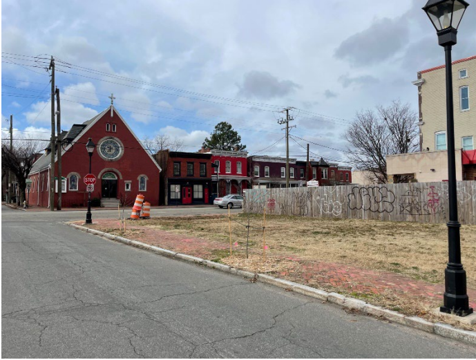
Figure 1. Vacant lot as seen from St. James Street looking south towards W. Leigh Street