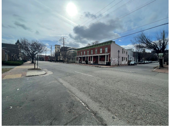
Figure 2. Looking south across W. Leigh Street from 2 W. Leigh Street