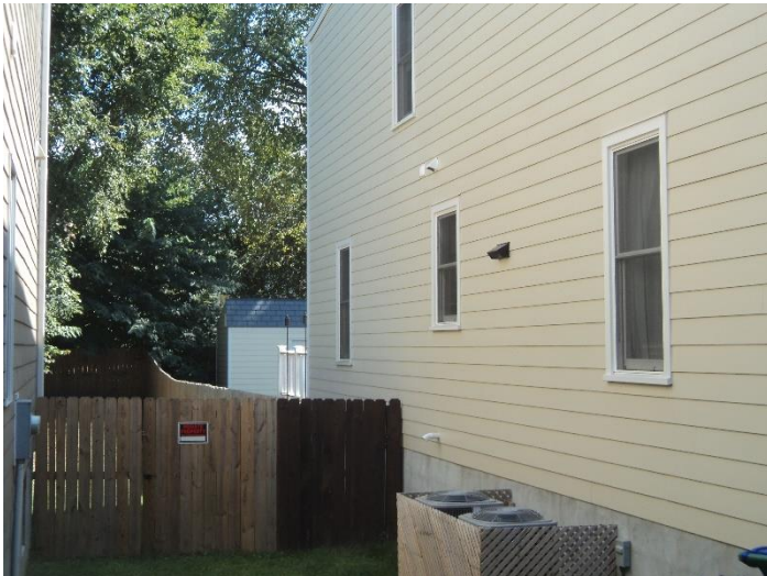
Figure 1. View of rear deck from North 28th Street