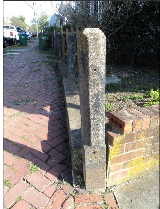
Metal Brackets and Screws on Concrete Posts at 2105 E. Marshall (April 2018)

Additionally, staff has located a photograph of the property from 1977 which shows a brick wall which was likely constructed in front of concrete posts. The photograph did show a metal fence between the concrete posts on the adjacent property. Staff has not located photographic evidence to support the applicant's proposed design.