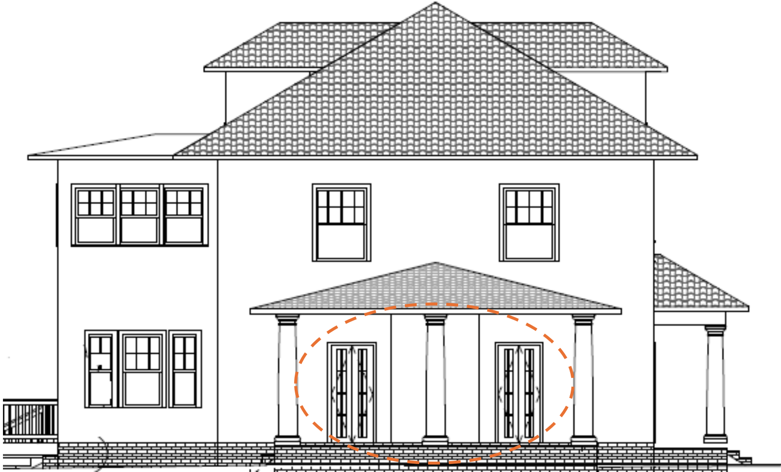
Existing South Elevation 3820 Hermitage Road