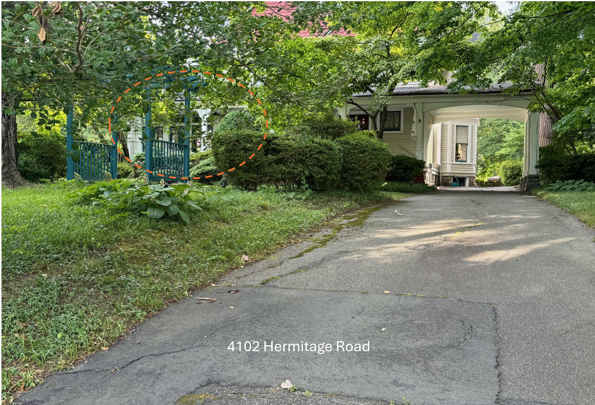
4102 Hermitage Road