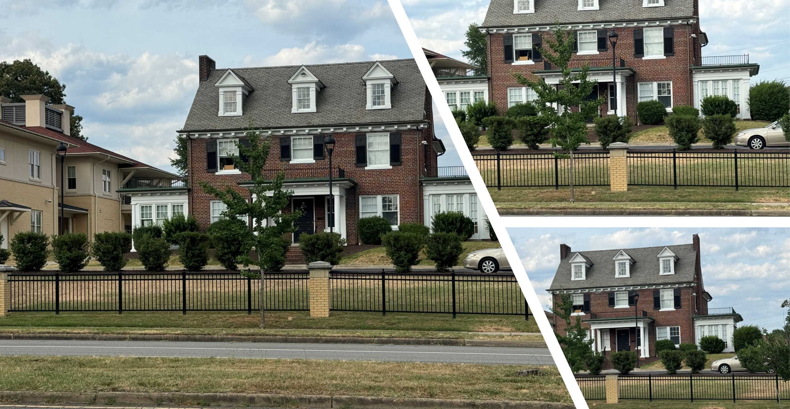
4215 Hermitage Road