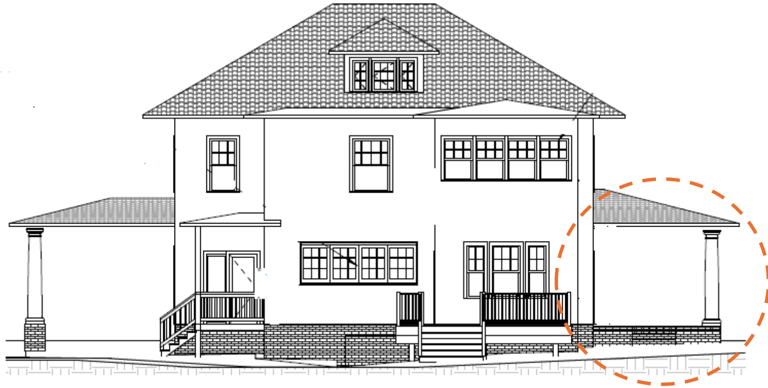
Existing West Elevation 3820 Hermitage Road