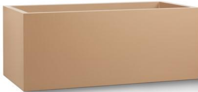
Figure 2- Example of fiberglass planter

Art design to be applied to planters (see next page)