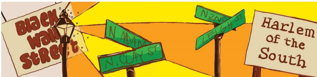
Figure 3- Artist rendering of planter art