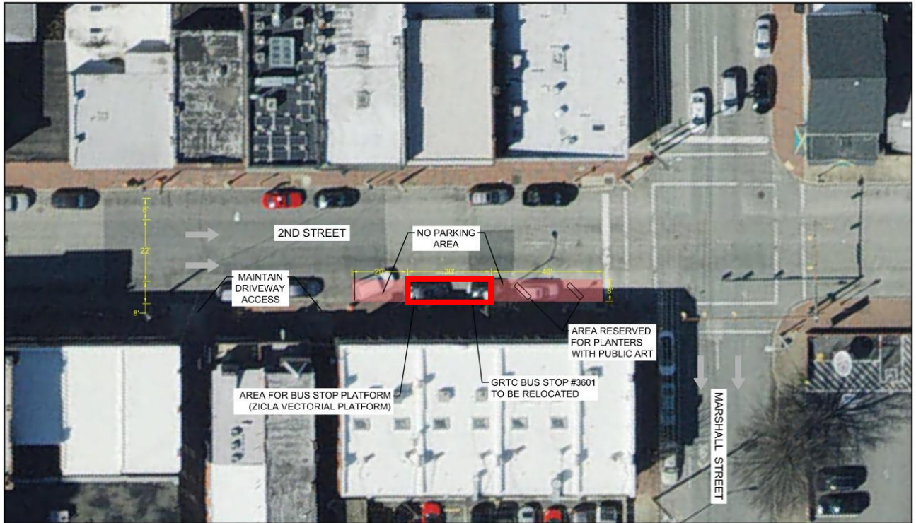
Figure 1- Exhibit: 2 nd Street project