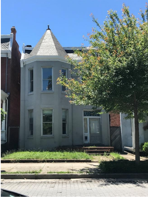
Figure 1. Facade, 2019