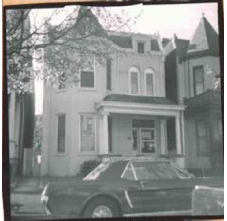
Figure 2. Facade, 1957-1977