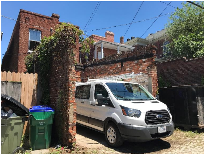
Figure 3. Garage, 2019