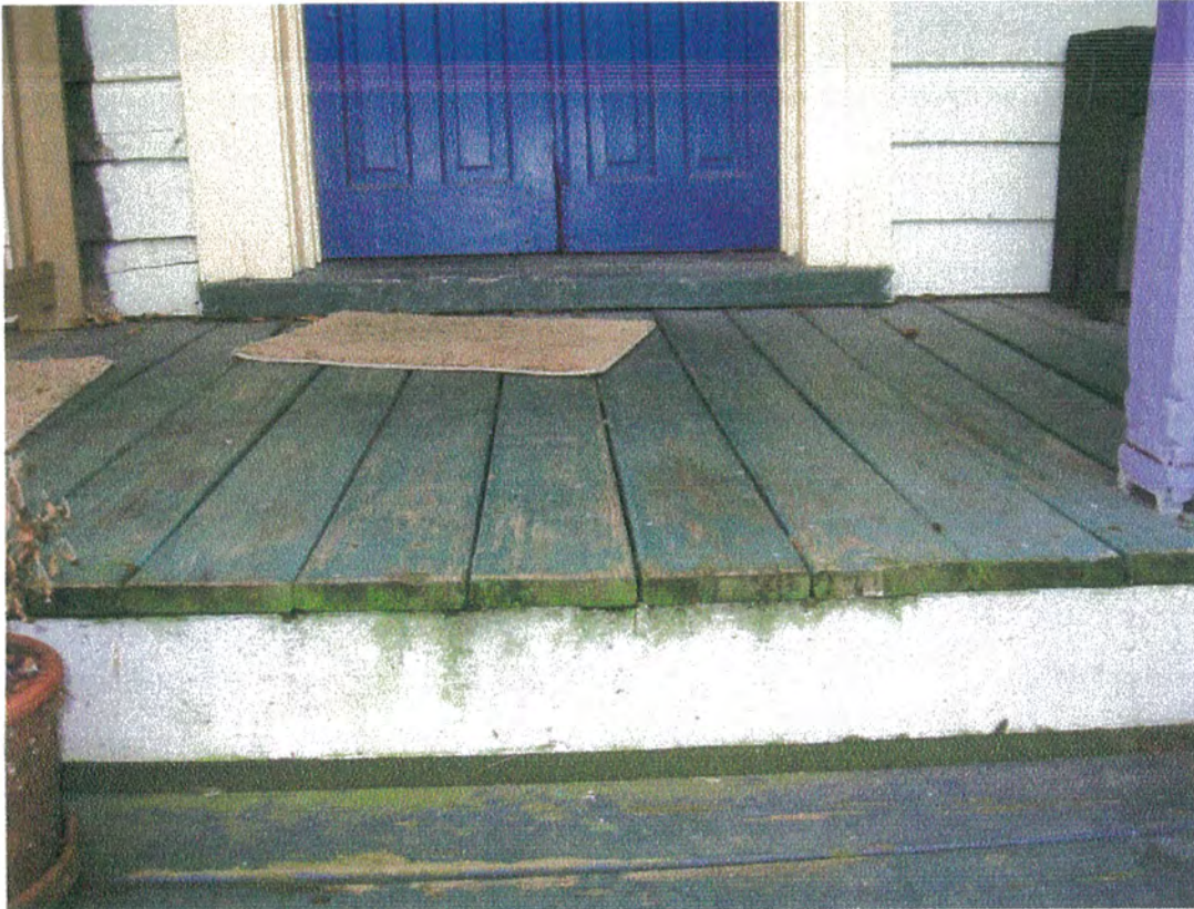
Damaged deck boards to be replaced in-kind