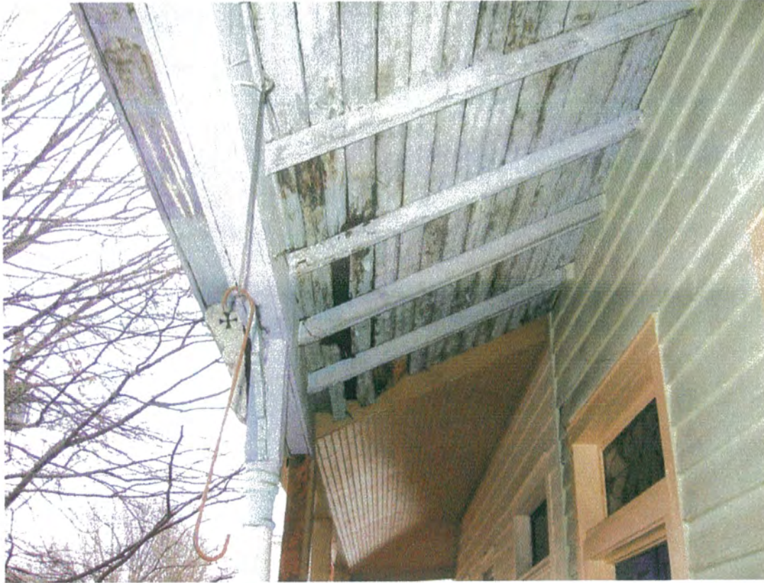
Damaged beaded T&G to be replaced in-kind, rafters to remain exposed