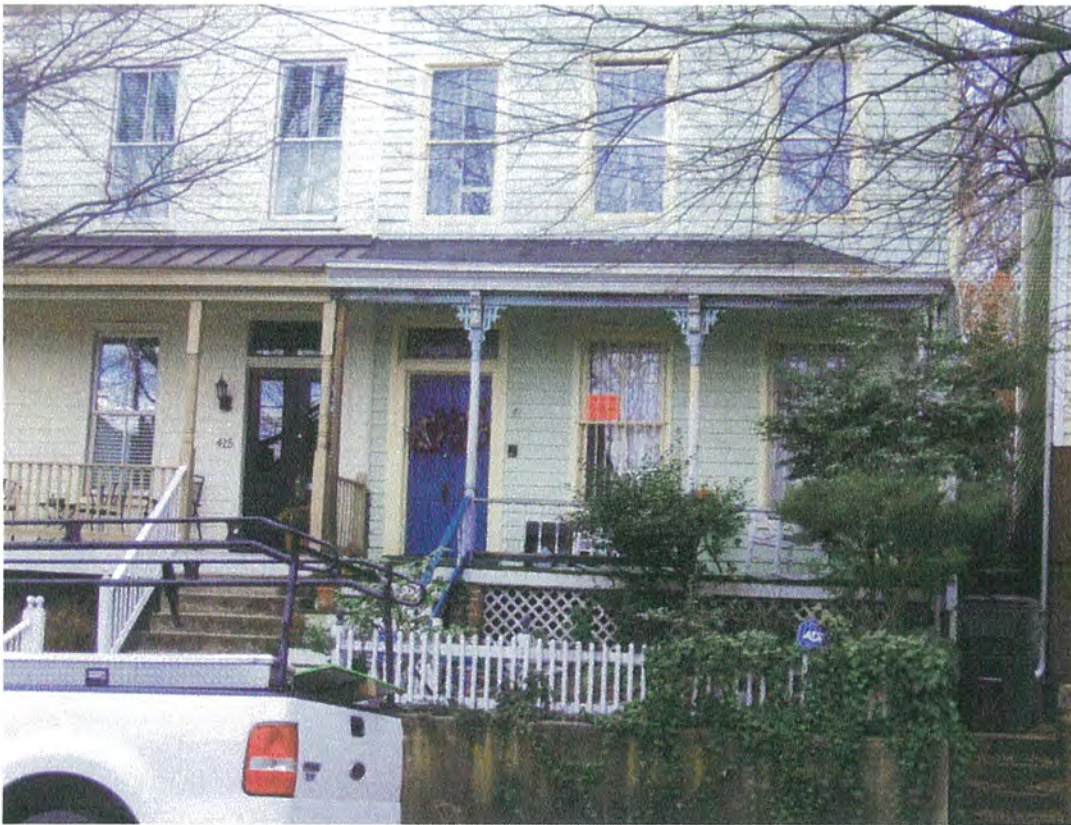
Decking, balustrades and steps constructed of treated materials

The front porch has been largely reconstructed with treated materials -- steps, decking, and balustrade. The turned columns and brackets are original as is the porch ceiling structure -- beaded t&g and exposed rafters. The porch will be structurally reinforced from below and the posts and brackets will be retained, scraped and painted white. The existing membrane roof will be removed and the damaged beaded t&g boards will be replaced in-kind and a new membrane roof will be installed over 7/16" OSB. New galvanized gutters and downspouts will be installed. The cornice and soffit will be repaired. A new Richmond rail balustrade will be installed between the turned columns and damaged, treated deck boards will be replaced in-kind. The existing staircase will be removed and reconstructed with like materials and new aluminum railings with vertical pickets will be installed on both sides of the staircase. The railing will be anchored to the porch deck and the concrete landing.