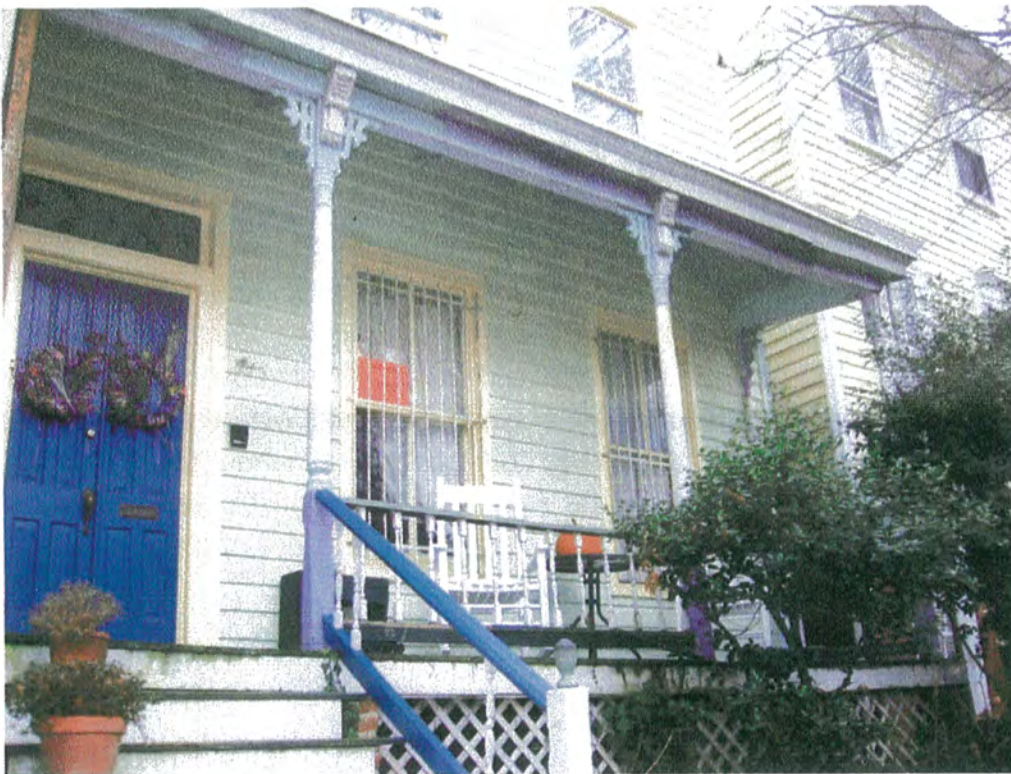
Turned posts and brackets to be retained, soffit to be repaired