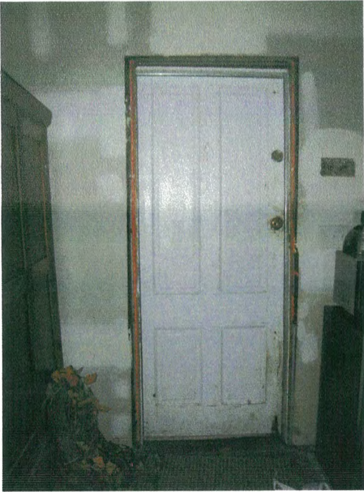
Rear door to be replaced with new 4-panel wood door