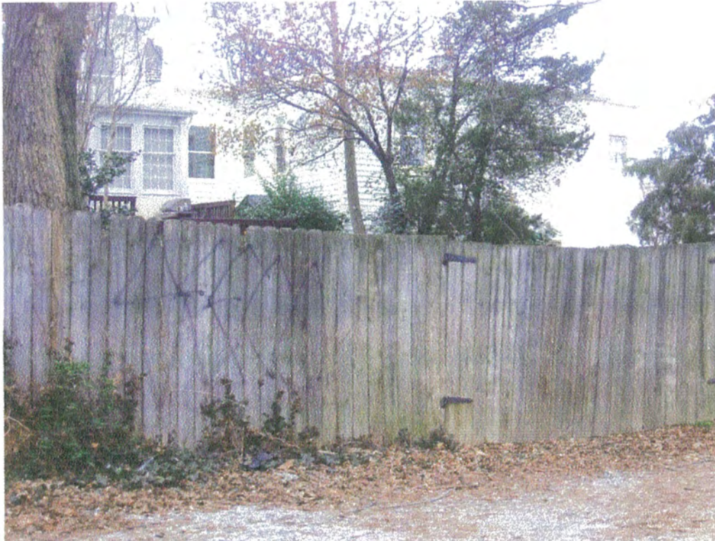
View from alley