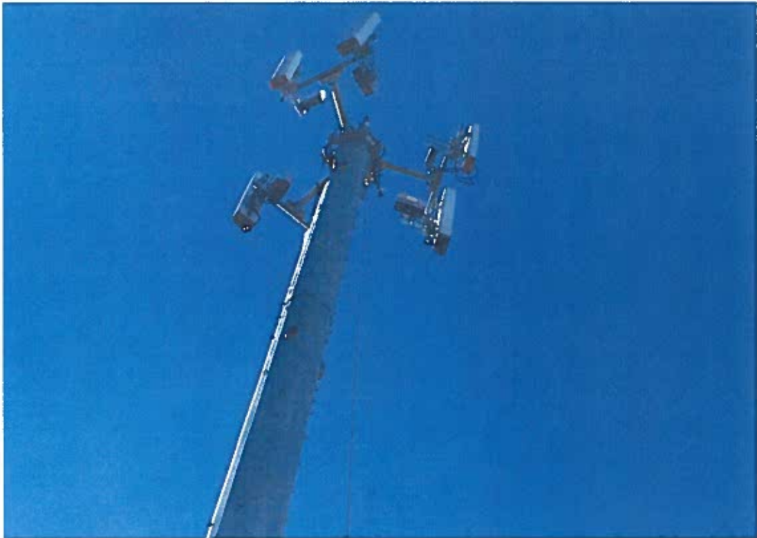
3200 – Cell Tower – 3 - Receivers