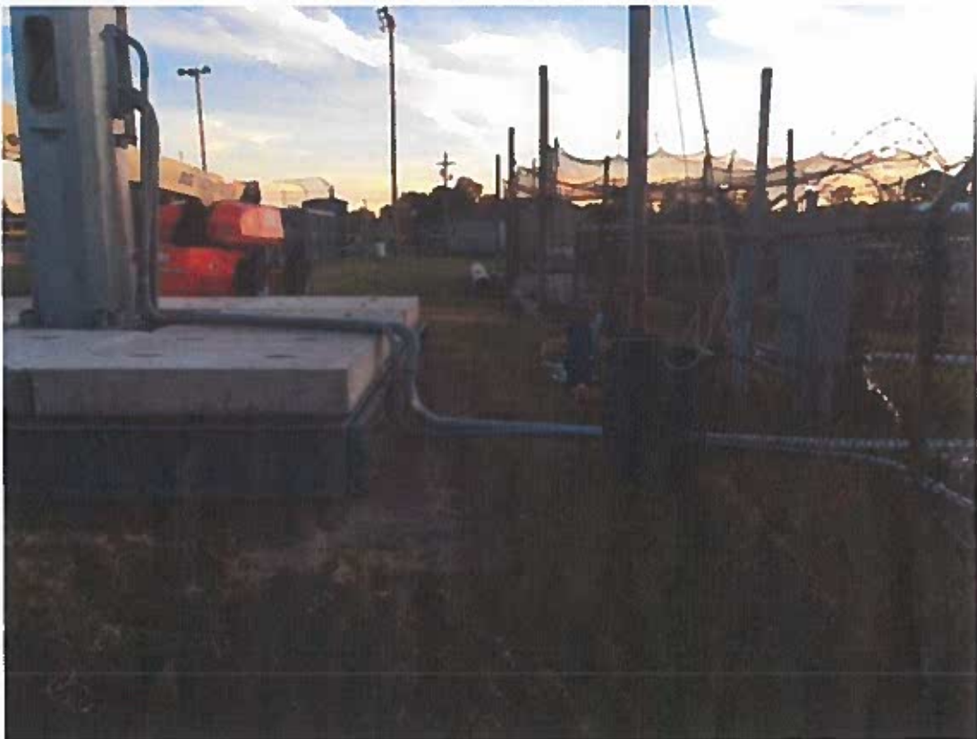
3200 – Cell Tower – 4 - Electronic Cables