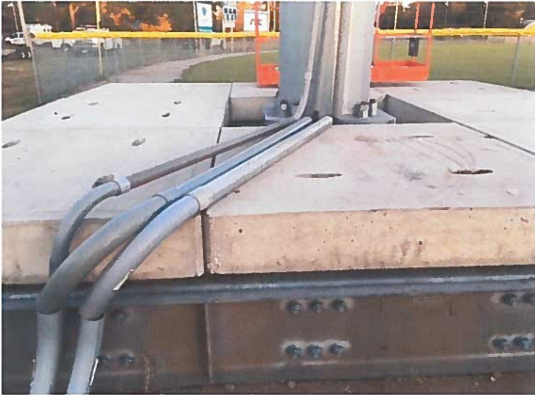
3200 – Cell Tower – 5 - Concrete and Steel Counter Weights