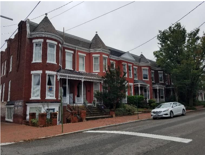
Figure 3. Adams Row, 2300-2316 E. Marshall Street.