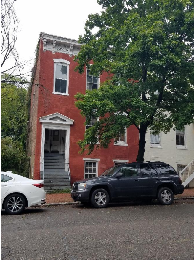
Figure 1. 2320 E. Marshall Street, existing building.