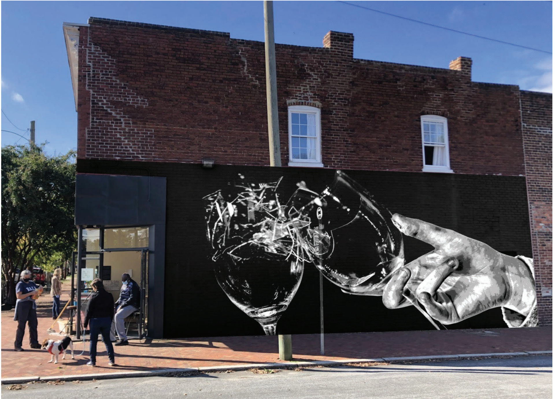
Second Bottle Mural Mock-up