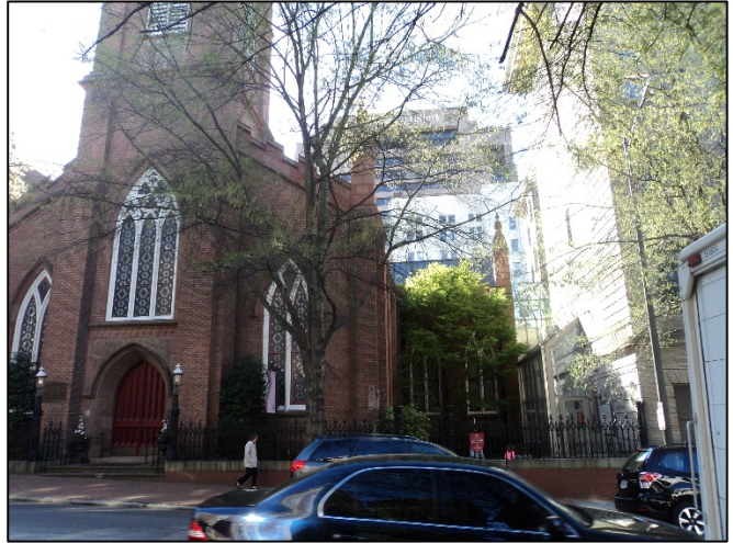
Figure 2. Existing Glass Atrium and Church Corner, April 2018.