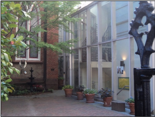
Figure 3. Existing Glass Atrium and Church Corner Detail, April 2018.