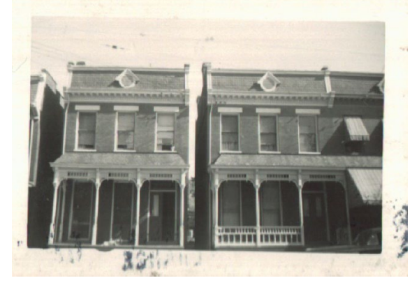
Figure 3. East Elevation. 2408 East Clay Street.

Figure 1. 2404, 2406, and 2408 East Clay Street. Assessor's photo 1950s.