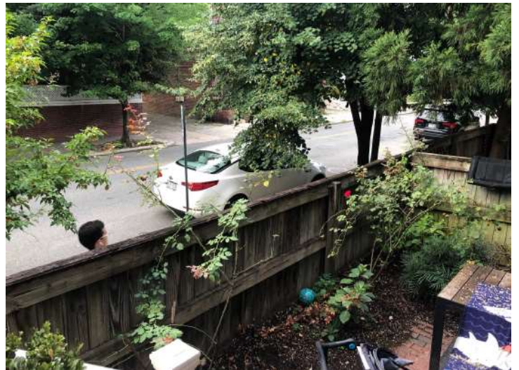
Figure 6. View of existing fence from inside the property.