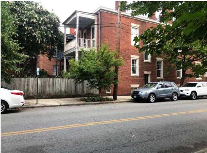
Figure 5. View of existing fence from Meadow Ave.