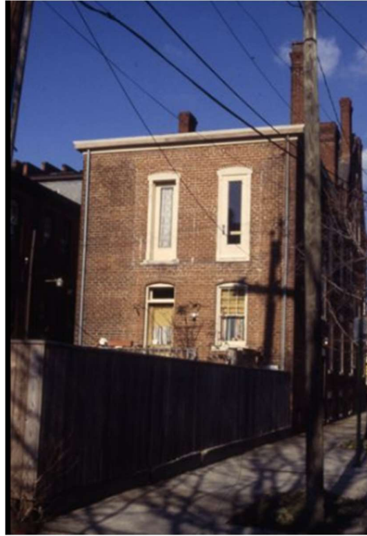
Figure 4. Photo from 1990s showing rear fence.