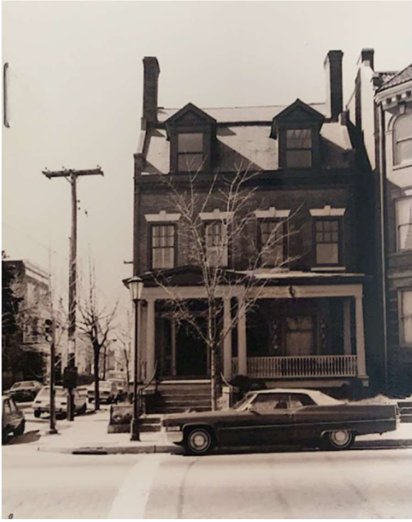
Figure 3. Historic photo from Assessor's office.